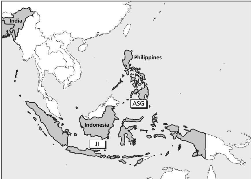
Figure 11.1 Southeast Asian Cluster

NOTE: See the Abbreviations for full names of groups.