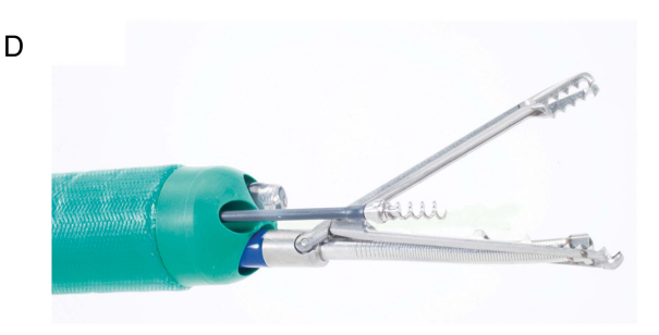
Figure 2 Multitasking platforms: (A) EndoSamurai; (B) ANUBISCOPE; (C) R-scope; (D) TransPort.