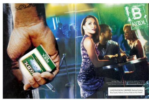
Fig. 2. Alcohol is often portrayed in tobacco advertisements in tobacco industry's lifestyle magazines. Newport's cigarette advertisement (upper left) in P.S. (Spring 2005) shows young adults smoking cigarettes and drinking alcohol in a bar setting, typically engaging in sociable behavior. CML (Spring 2000) magazine "catalog" feature (upper right) is difficult to distinguish from a Camel cigarette advertisement, and depicts both cigarette and alcohol in a party setting, and includes a warning label on the facing page. Kool's advertisement (bottom) in Flair (Holiday 1999 and Spring 2000) and Real Edge (January 2000, September and November 1999) features the image of a man's hand holding a pack of Kool cigarettes and a lit cigarette. In the foreground, with group of young adults enjoying alcohol in a bar setting.