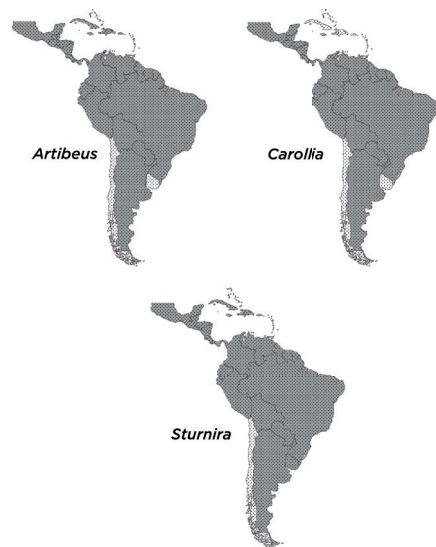
Fig. 2. Distribution of three bat genera ( Artibeus , Carollia and Sturnira – solid gray) and the four most frequent plant genera ( Cecropia , Ficus , Piper and Solanum – dotted pattern) in their diet in the Neotropical region. Sources: bat distribution follows GARDNER (2008); plant distribution follows JARAMILLO & MANOS (2001) for Piper ; KNAPP et al. (2004) for Solanum , LOBOVA et al. (2003) for Cecropia ; SHANAHAN et al. (2001) for Ficus .

the most consumed fruit species by Artibeus in Bolivia, Brazil, Costa Rica, Cuba, Guatemala, Mexico and Panama. However, when compared to the other fruit genera consumed the difference was significant only in countries with a large total number of fruit consumption records. This was true for Brazil ( n=924 ), Costa Rica ( n=638 ), Panama ( n=304 ) and Mexico ( n=205 ), but not for French Guiana ( n=556 ), where the consumption of fruits from the genus Cecropia predominated (Tab. I).