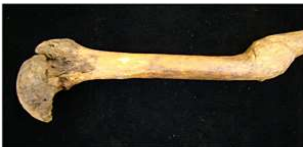
Figure 6. Healed fracture of the femur in an adult male individual (S95).

Antemortem trauma was observed in six individuals. Two women (S107 and S112) presented with possible parry fractures of the ulna. These fractures were well healed and remodelled. Well-healed fractures were also seen in the left femoral shaft (Figure 6) of a male individual (S95) and left proximal humerus (Figure 7) of a female individual (S4). Secondary osteoarthritis of the os coxa (male individual) was evident as a result of the injury sustained. The femoral fracture is also malunited, suggesting that it could not be immobilised properly before healing took place. As a result of the humeral fracture sustained in the female individual, complete ankylosis of the shoulder joint occurred. This would have resulted in immobility of the upper left limb. Pseudoarthrosis of the left clavicle (Figure 8) was seen in a man (S61). Healing of the fracture was not successful, although signs of bone remodelling were present. This most likely resulted because of constant movement, preventing the fracture from healing.