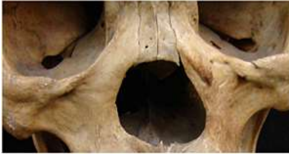
Figure 1. Destruction of the interior nasal structures in a woman (S7) aged 20 to 30 years.

Individual S42 (a man aged 40–59 years) also had periosteal reactions on all upper and lower long bones, although no gummatous lesions were found on the skull. The degree of bone involvement in this case would indicate that the disease was in an advanced state (Ortner, 2003). Although the pattern of long bone involvement is similar to diagnostic criteria for venereal disease described by Hackett (1975, 1976) and Waldron (2009), the absence of cranial involvement may establish a diagnosis of treponemal disease with reduced confidence. Hackett (1975) stated that only when cranial lesions ( caries sicca ) in combination with periostitis of the long bones are present can a diagnosis of venereal disease be made with accuracy and confidence. However, the presence of bilateral long bone involvement in subperiosteal deposition of new bone and thickening of the diaphysis and metaphyses, as well as the pathological changes being most advanced in the lower legs, suggest that this may indeed be venereal treponematosi (Rothschild & Rothschild, 1996; Mays et al. , 2003).