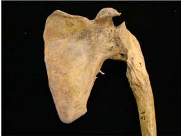
Figure 7. Healed fracture of the humerus in an adult female individual (S4).