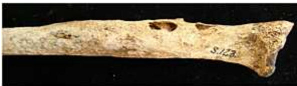
Figure 2. Non-specific osteomyelitis with cloaca formation of the left radius in an adult male individual (S123).

One case of non-specific osteomyelitis was also encountered. A male individual (S123) aged 20–39 years had severe osteomyelitic changes with cloaca formation on the left radius (Figure 2). The hand bones and humerus appeared normal (no ulna present). There was no evidence of trauma or specific infectious disease, which suggests that the mode of infection may be haematogenous.