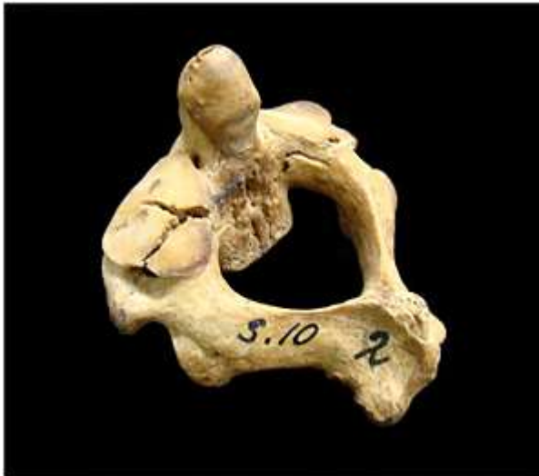
Figure 9. Hangman's fracture in an adult male individual (S10).

The incidence of fractures in this study was found to be similar to that of the Venda population ( n = 8 ; 7.1%). However, a highly significant difference was seen between the current sample and the Gladstone population ( \chi^2 = 26.566 ; p < 0.0001 ), with the Khoesan group much less affected. These results suggest that the current study group did not sustain as many work-related injuries as seen in the mineworkers from Gladstone but rather suffered occasional injuries brought about by isolated accidents or events.