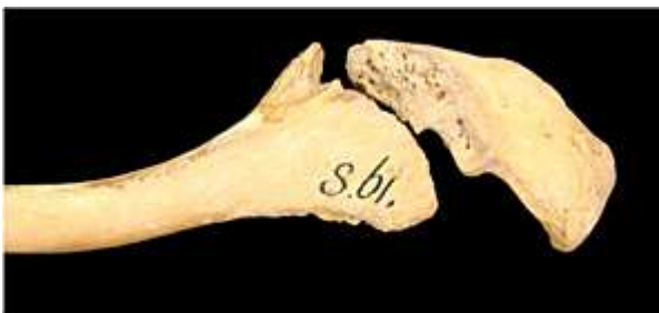
Figure 8. Pseudoarthrosis of the left clavicle in an adult man (S61).

Individual S24 (a man aged 40 to 55 years) sustained multiple fractures, which included a well-healed fracture of the left ulna (a possible parry fracture), a fracture of the left femoral head that had healed only partially and a fracture in the subtrochanteric area of the left femur which may have occurred shortly before death as almost no healing was observed. The complete left leg appeared largely porotic in comparison with the rest of the skeleton, which may have resulted from the leg not being used because of discomfort caused by the fracture of the femoral head. The osteoporotic state of the femur may have been the cause of the fracture that occurred in the subtrochanteric area. It is possible that the fractures to the ulna and femoral head were caused by the same traumatic event, with the third fracture (subtrochanteric fracture of the femur) occurring as a complication of the initial injuries.