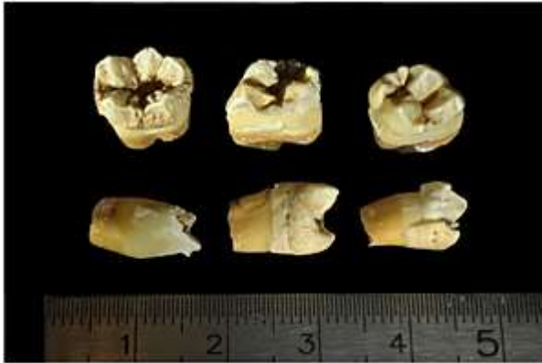
Figure 4. Severely malformed enamel crowns of permanent molars and premolars in a juvenile (S32).

The bottom row represents (from left to right) a lower first premolar and two upper first premolars. The enamel showed post mortem damage on quite a few of the teeth. Several pits and grooves could be seen on the tooth crowns. The formation and deposition of enamel appeared to have been disrupted during development. A differential diagnosis was established that included congenital treponematosi s, hypoplastic amelogenesis imperfecta and cuspal enamel hypoplasia.