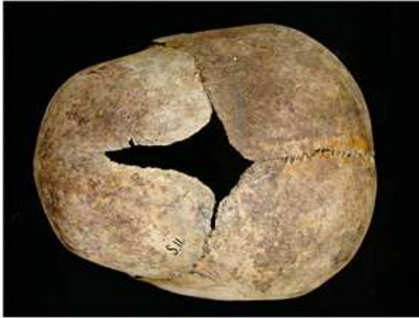
Figure 5. Open anterior fontanelle in an infant (S11) aged 15 to 18 months.

This suggests that these individuals suffered from possible chronic infection and/or malnutrition. Large anterior fontanelles have also been noted in an early 20th century rural population from the North West Province (Maroelabult), South Africa, in which four individuals presented with the phenomenon (Steyn et al. , 2002a) and probably attest to the poor health and marginalisation of these groups.