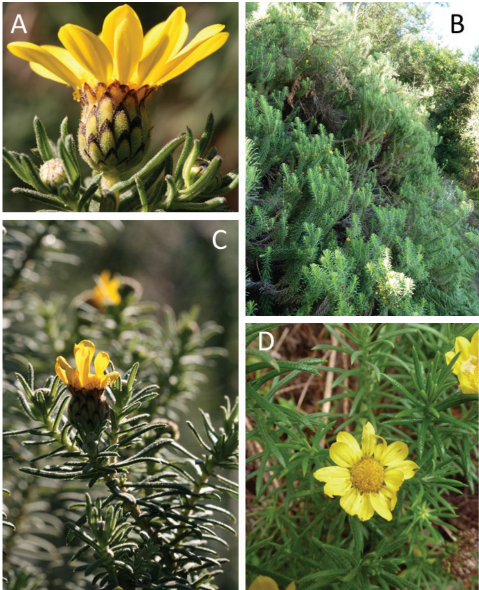
Plate 2. The poorly known Great Winterberg–Amatholes endemic Macowania revoluta Oliv. A a capitulum showing the distinctive dark involucre margins ( Bentley J 1 ) B shrubby, candelabra growth habit (above Wolf River Main Forest along the Amathole Hiking Trail, specimen not collected) C detail of flowering stem ( Bentley J 1 ) D young plant showing ruderal tendencies ( Clark VR 451 ).

found by recent phylogenetic analysis to be nested within Macowania , as sister to M. revoluta (Bentley et al. 2014; the taxonomic revision is currently in progress). Arrow-smithia styphelioides differs in its sharply acuminate, ovate leaves, absence of the raised abaxial midrib, as well as in several features of the reproductive organs. Otherwise, no