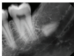
Figure 2: Peri-apical radiograph of fractured root (38) taken at the time of the post mortem (age 23 years).

individual could not be made because of this otherwise unexplainable discrepancy. This led to a lot of anguish for the boy's family, as the body could not be released for burial. Identification was finally confirmed through DNA analysis, a process requiring a further six weeks.