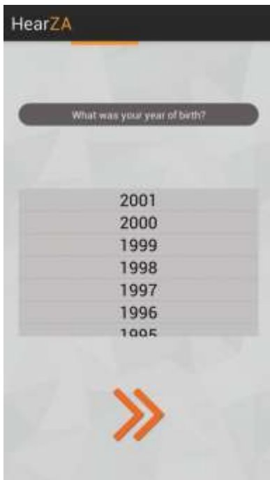
Supplementary material 1c. The year of birth is selected by scrolling up or down and tapping on the appropriate year.