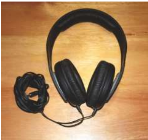
Supplementary material 2d. Sennheiser HD 202 II supra-aural headphones.