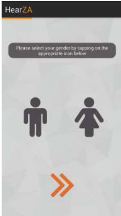
Supplementary material 1b. Gender is selected by tapping on the appropriate icon.