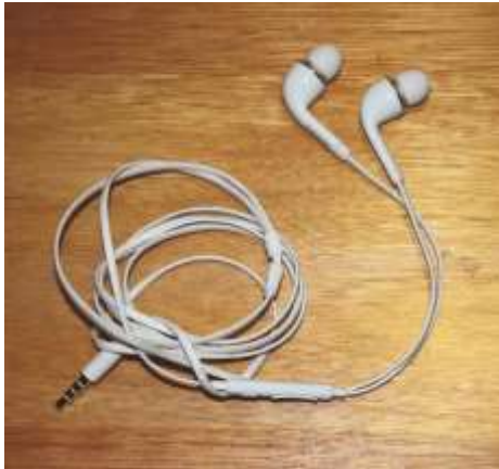
Supplementary material 2c. Intrachonchal earphones accompanying the Samsung S5 top-end smartphone.