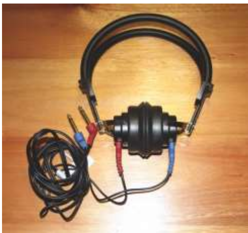
Supplementary material 2e. TDH 50-P audiometric supra-aural headphones.