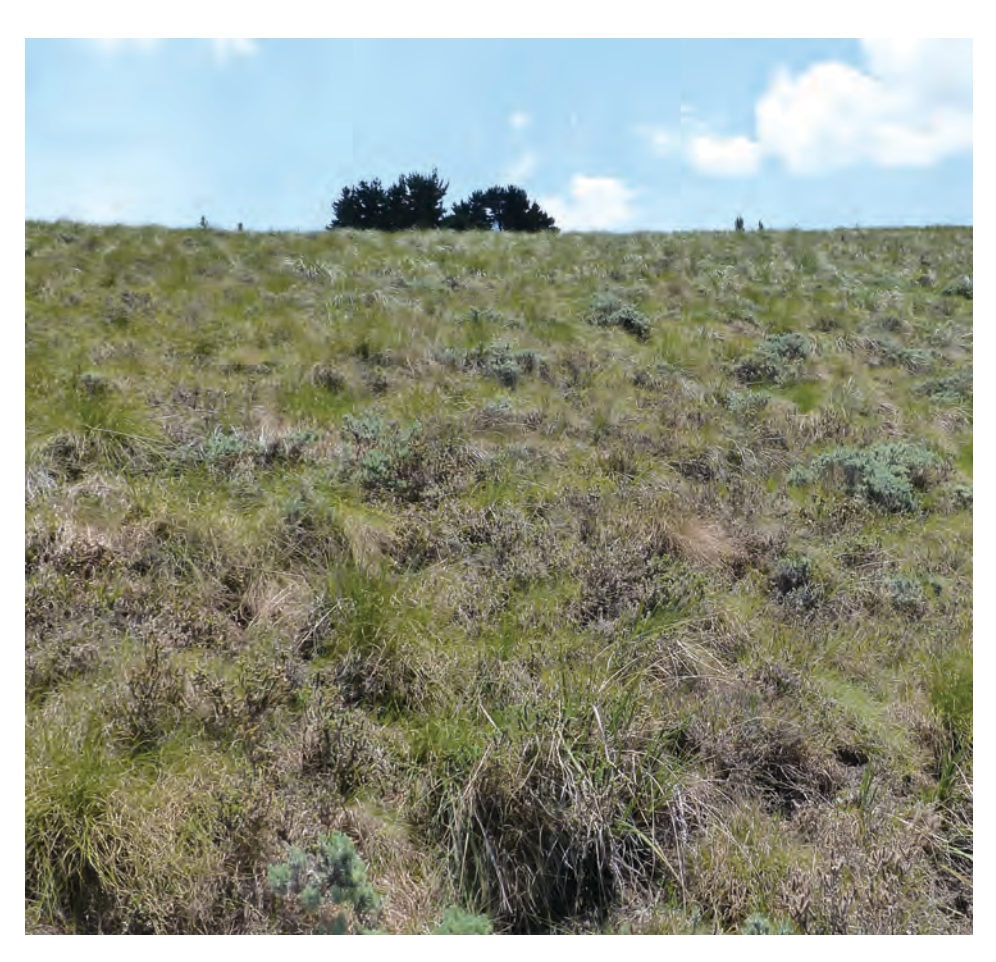
Moribund plateau grassland: the apparently favoured habitat of Lotononis harveyi . It would seem that grazing and fire are detrimental to the survival of this species, and it has only been found on sites where both have obviously been excluded for some time.