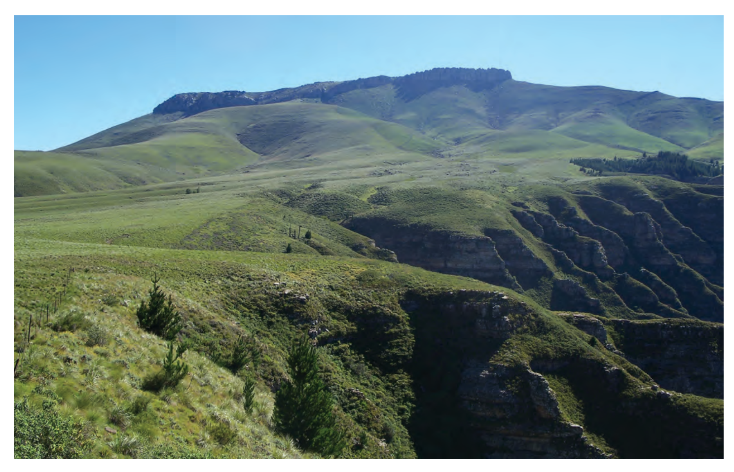
The Fenella Gorge environs (foreground) with the Great Winterberg peak (background) has been relatively well-explored botanically, but east of here might offer more possibilities for Lotononis harveyi . Note the invasive Patula Pine ( Pinus patula ) trees.

since suggests that the species grows extremely slowly, and this may partly account for its apparent rarity.