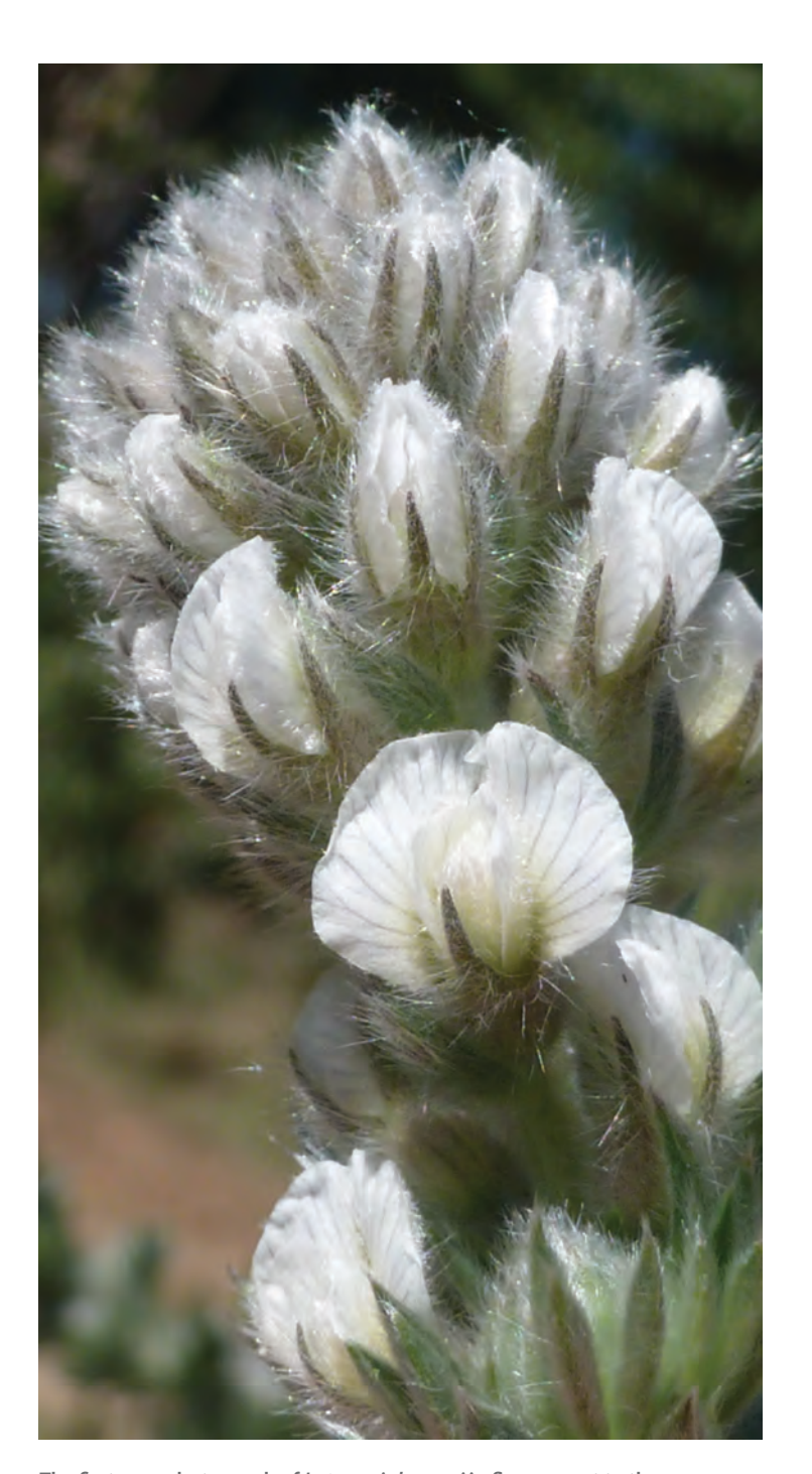
The first ever photograph of Lotononis harveyi in flower, next to the 19th-century wagon track over the Great Winterberg (Eastern Cape province).

South Africa is often thought of as 'well-explored' and 'well-studied'. The exciting thing is that it's not – especially if you add 'biodiversity' and 'mountains' to your search engine. The Cape Midlands Escarpment, for example (comprising the Sneeuberg, Great Winterberg–Amatholes and Stormberg, mostly in the Eastern Cape province, South Africa) has seen numerous plant discoveries and rediscoveries since 2005. This has been the direct result of focused biodiversity exploration in this region.