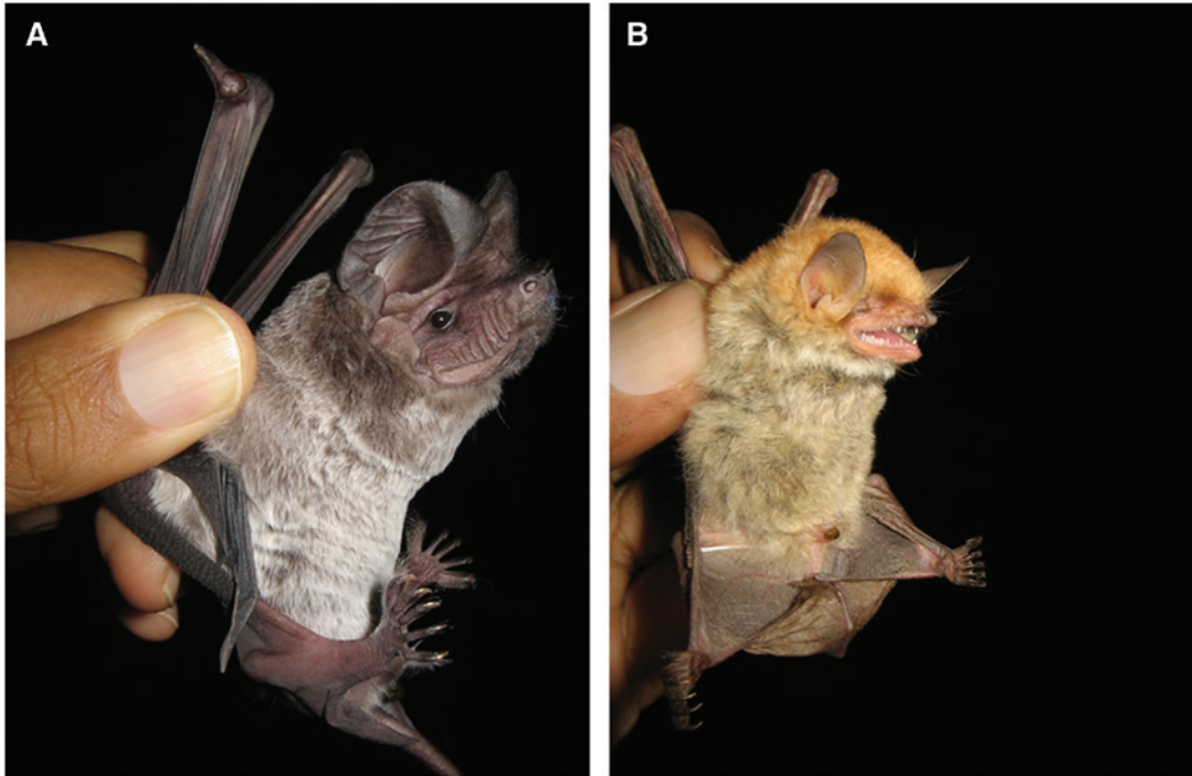
Figure 2: Photographs of the specimens of the two species recorded from new localities in Swaziland: (A) Mops midas (DM 14563), (B) Myotis bocagii (DM 13644).

Myotis bocagii is widely but patchily distributed in sub-Saharan Africa, being mostly associated with riverine habitats in forest and savanna zones (Rosevear 1965, Monadjem and Fahr 2007, Happold 2013). In the forest zone, it is frequently associated with banana plants where it has been captured roosting during the day in furred banana leaves (Rosevear 1965, Monadjem and Fahr 2007), but may also roost in palms of the genus Hyphaene , as well as in hollow trees (Happold 2013). Its roosting sites in the savanna zone are not known, but it is closely tied to open water bodies where it trawls for insects (Happold 2013). The records from Swaziland are not surprising since the species has been recorded from Kruger National Park to the north and Mkhuzi Game Reserve and Krantzklouf Nature Reserve to the south (Monadjem et al. 2010a). However, the distribution and habitat preferences of this species are still poorly known south of the Limpopo River, and the species has yet to be recorded in southern Mozambique (Monadjem et al. 2010b) to the east of Swaziland.