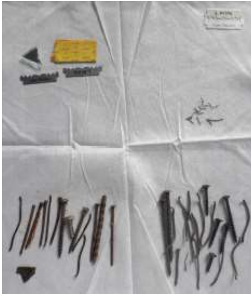
Fig. 6 All foreign objects retrieved from the gastrointestinal tract and clothing

The visceral organs (liver, spleen, and kidney) were pale. The cause of death was ascertained to be hemorrhage secondary to foreign body (razor blade) ingestion.