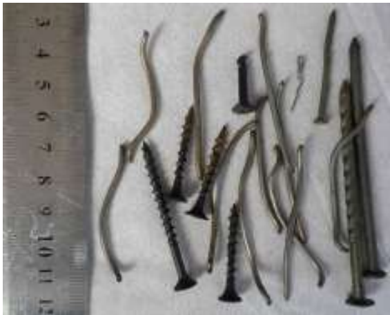
Fig. 5 The items retrieved from the cecum, including the largest item measuring approximately 7.5 cm in length