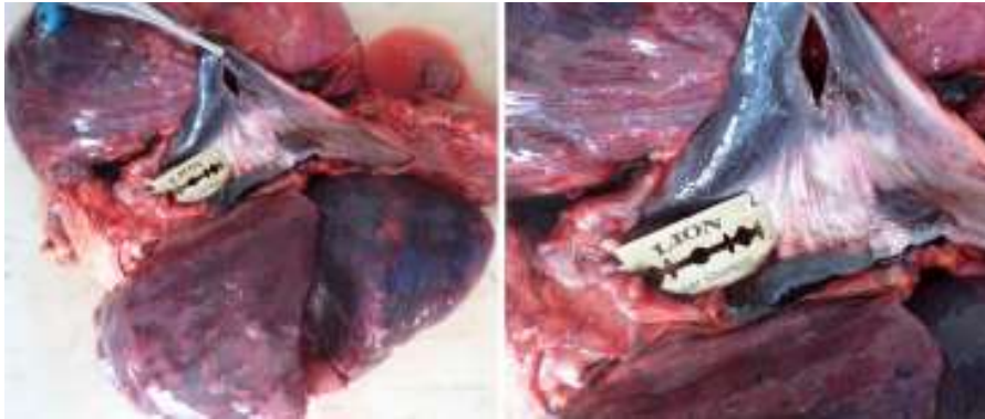
Fig. 2 The posterior aspect of the esophagus showing the perforating defect through the posterior wall

external examination and the deceased was well nourished and of average build. Internal examination showed superficial incisional wounds to the tongue and blood was present in the mouth. No injuries were present in the neck structures and there were no fluid collections in the thoracic or abdominal cavities. Removal of the thoracic organs revealed an extensive posterior hemomediastinum and upon opening of the esophagus a single razor blade was found lodged within the esophageal lumen. Multiple incised wounds were present in the posterolateral wall of the esophagus, with associated signs of hemorrhage (Fig. 2). The trachea contained blood and upon sectioning, the lungs showed patchy hyperemic areas suggestive of aspiration of blood. There was an incised wound in the anterior wall of the descending thoracic aorta subjacent/immediately posterior to the injuries described in the esophagus.