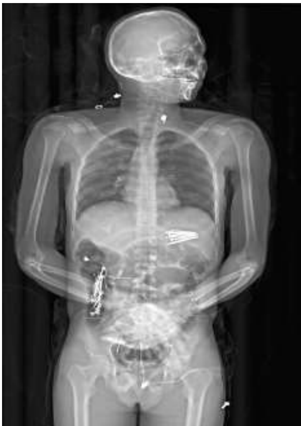
Fig. 1 A full body LODOX ® Statscan depicting the presence of the foreign metal objects throughout the gastrointestinal tract—the razor blade is not visible in the esophagus

A postmortem full-body scan using the LODOX ® Statscan was performed prior to the commencement of the autopsy and confirmed the presence of multiple sharp radio-opaque foreign objects in the region of the stomach, small bowel, descending colon, and sigmoid colon (Fig. 1).