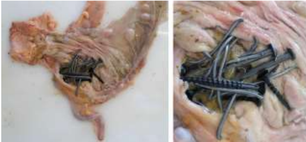
Fig. 4 The cecum showing multiple ingested metal objects at the ileocecal junction

intestines approximately 21 mixed foreign objects including nails, screws, pieces of metal wire, and a triangular piece of metal were present within the cecum, the largest of which measured approximately 7.5 cm in length (Figs. 4, 5). A single metallic nail was noted in the ileum and multiple small pieces of metal wire/staples were present in the descending colon and sigmoid colon. No perforations or hemorrhages were noted within the intestinal lumen. A total of 49 foreign objects were retrieved from the gastrointestinal tract (Fig. 6).