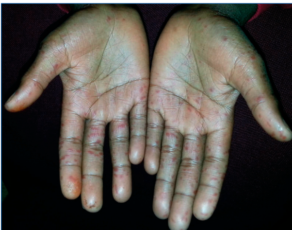
Figure 1: A macular rash on the palms of the patient. A similar rash was also noted on his soles

In August 2013, a 12-year-old boy infected with human immunodeficiency virus (HIV), who has been on antiretroviral therapy for more than two years, presented to the Tshwane District Hospital HIV clinic with fever and a rash. His symptoms had started two days ago. The rash was mainly on the palms and soles, and was sometimes itchy. His antiretroviral (ARV) drug regimen consisted of zidovudine, lamivudine and nevirapine. He was no longer receiving prophylaxis for pneumocystis pneumonia at the time of consultation.