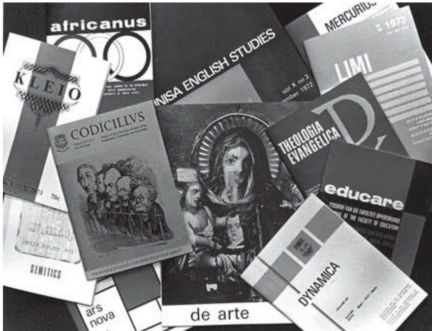
Figure 3. A Unisa Press publicity photograph from the early 1970s, showing a selection of journals.

with more departmental journals, from History, Musicology, Semitics, Public Administration and Political Science, Education, Communication and Psychology. 61 The Latinate titles – such as Musicus , Politeia and Theologia Evangelica – were in line with the naming of book series at the time, which included Manualia and Documenta , and may have been intended to avoid the problem of bilingual titles. Figure 3 shows a selection of the journals from the early 1970s. The journals were managed editorially by academics in these departments, and largely featured articles by local researchers. In fact, it may be argued that Unisa’s early journals publishing was a form of ‘in-house’ publishing for its staff, and that this is why it was subsidised. In addition, the journals policy advocated that “[a]ny journal produced by the University should in the first place be aimed at University students ... i.e. purely student-oriented although no prescribed study material may be included....” 62 In other words, the publishing of academic journals by university presses was for some time seen as a support function for staff and students, rather than a significant platform for research.