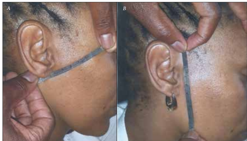
Fig. 2. Demonstration of bedside measurement of the parotid gland with a tape measure. Left: oblique line A - C; right: vertical line B - D.