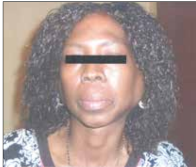
Fig. 4. The right parotid gland is grade III (26 cm) and the left is grade V (33 cm).

This grading system has revolutionised recording and communication of parotid gland enlargement in the ENT, head and neck and HIV/AIDS clinics at Steve Biko Academic Hospital, Pretoria, South Africa.