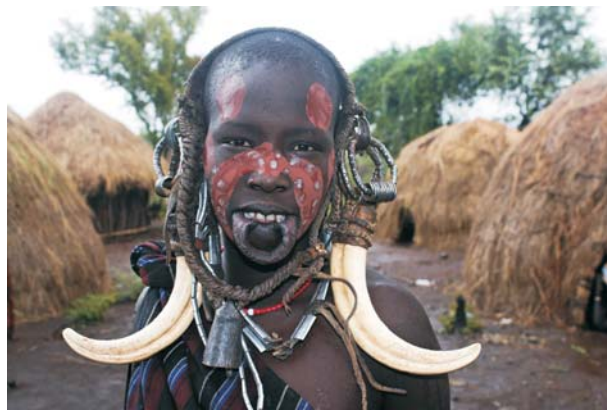
Image 6: A young Mursi girl wearing ceremonial wear including a bell and warthog tusks.

these atrocities are being committed not only by local police and labourers, but by the Ethiopian military currently tasked to protect foreign investments in the area (Survival International 2015). While this taints the image of the region, it still remains home to many incredibly vibrant cultures that, even though threatened, are resisting change and maintaining parts of their own way of life.