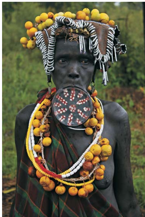
A Mursi woman with an elaborately decorated lip-plate and ceremonial wear.