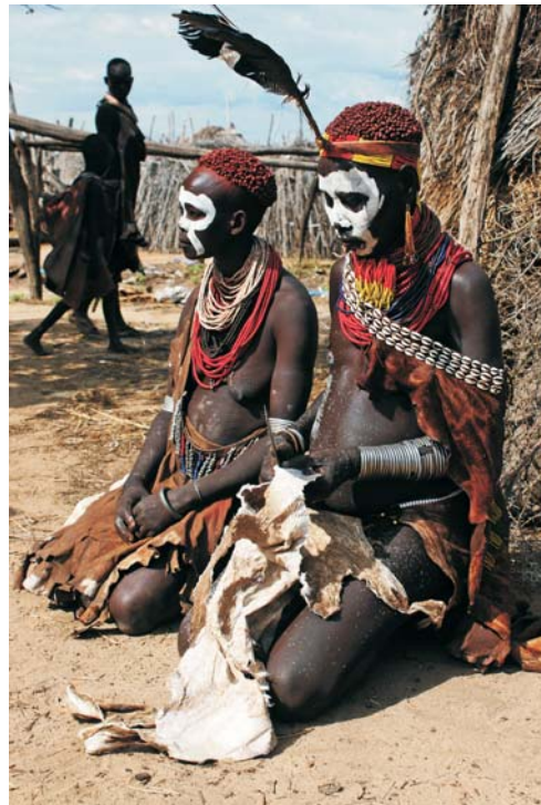
Hamar women preparing animal hides outside a residential hut. Note the cowrie shells, beads and metal bangles which are permanently fixed to the arm.