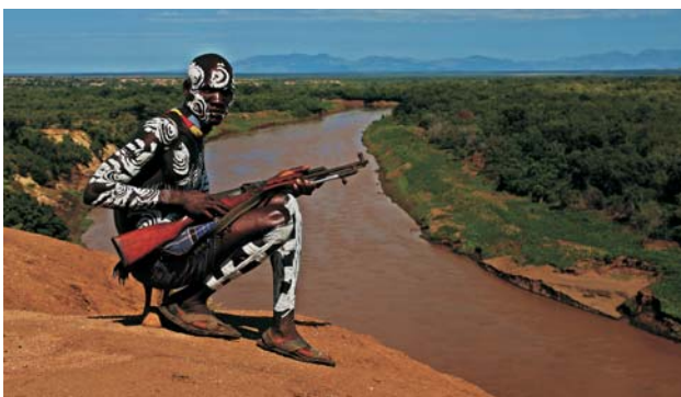
A Kara man with the lower Omo Valley in the background. This gentleman sat here knowing he would attract eager photographers willing to pay for an image.

Travelling through the southern Omo region provides one with a sense of great contrast between the lives of those who live there and that of our own. A visit is sure to enrich the observer with a deep realism, but one not entirely pleasant. Habitat destruction from the Gibe III dam development and large-scale agricultural enterprises that include sugar, cotton, oil palm and maize, as well as the introduction of sophisticated weapons, have all had a devastating effect on life-ways in the southern Omo. The reach of the modern world is taking a firm grasp on the ripe fruits the Rift Valley has to offer but does unfortunately not appear willing to share with local tribes. Reports of crimes against humanity and, rape accusations are increasing, and people are imprisoned with little explanation. Some of