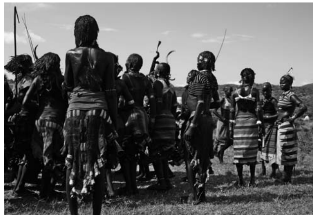
Women dancing at the bull jumping ceremony with rattles below their knees, horns and bells.

Lip-plates are not all that the Mursi people are known for. They are renowned locally as an aggressive and unlikable tribe while also possessing great wit and humour. Their tenacity can be seen in the stick-fighting ceremony, said to be the most brutal in the region. Stick-fighting or duelling involves young unmarried men keen to impress girls. A stick or donga measuring about 2 m long is used to strike an opponent, who is defeated when he falls to the ground or concedes willingly. Each duellist is adorned with elaborate protective garments known as a duelling kit and includes a thick headdress (Brittain et al. 2013), which also serves a decorative purpose. The ceremonies may involve up to a dozen affiliated clans, not all of whom