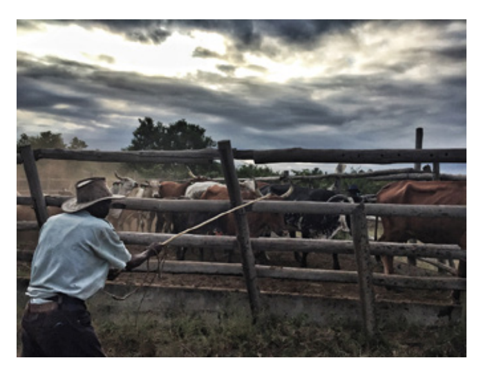
Herdsman help to urge the cattle through the diptank

Without haste our first patient is wrestled down. As the herd dogs sniff at our heels, we begin our clinical. Upon palpation, we quickly learnt our second lesson – the trajectory of an abcess is not to be underestimated.