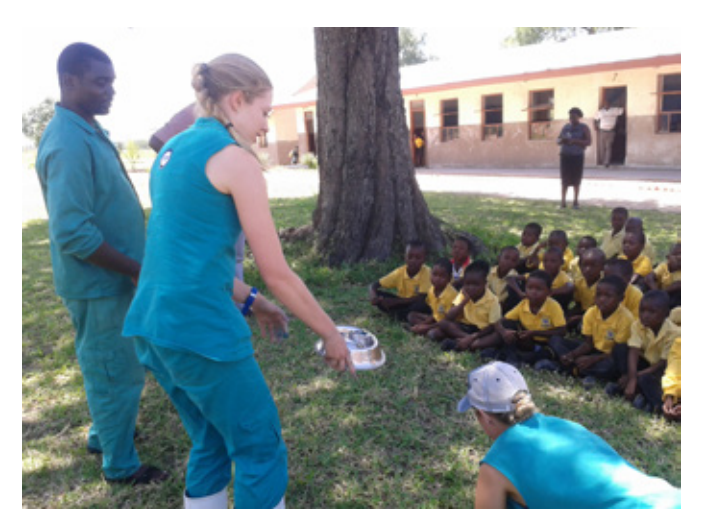
OP students talk to learners about caring for their pets