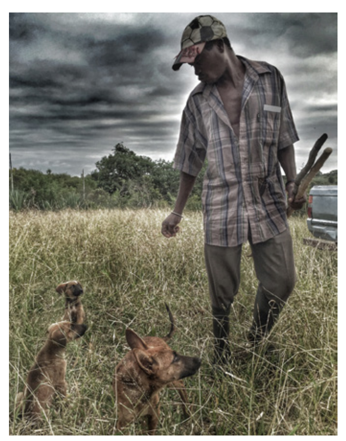
Mnisi herdsman bring their animals to the diptank

As we arrive at our first diptank, the clanging of bells, bellowing of cows, barking of dogs and whistling of herdsmen fills the air with a buzz of activity. This is life at Mnisi and it pulses through the atmosphere – "Avuxeni" – a good morning indeed.