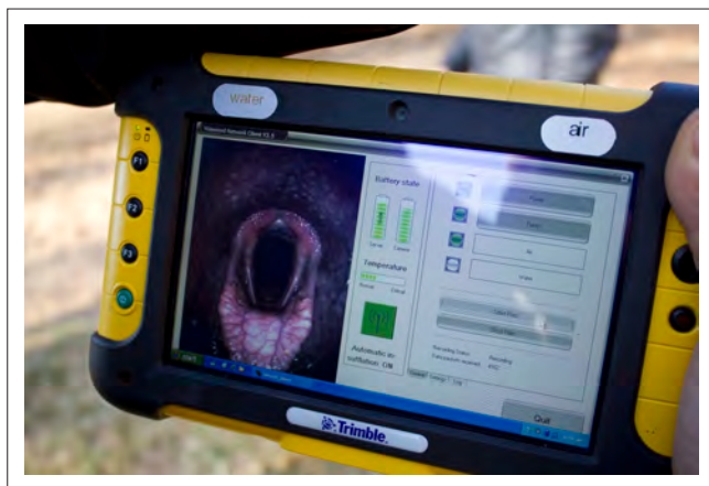
FIGURE 3: Dynamic overground endoscopy examination at gallop.