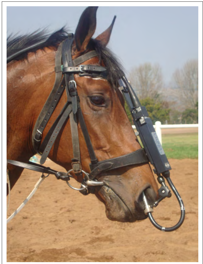
FIGURE 1: Placement of the endoscope at the racetrack.