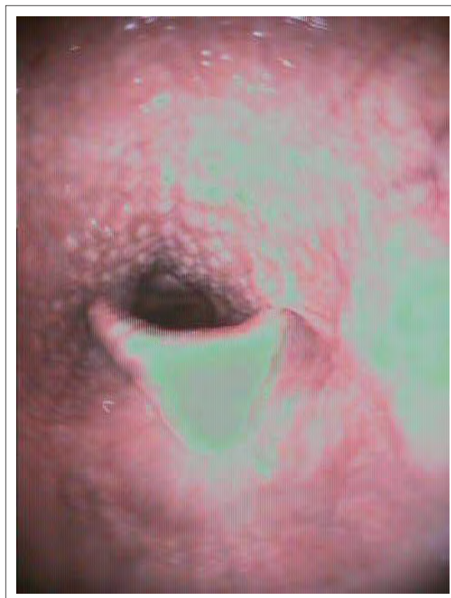
FIGURE 7: Single abnormality observed in the study: Dorsal displacement of the soft palate.