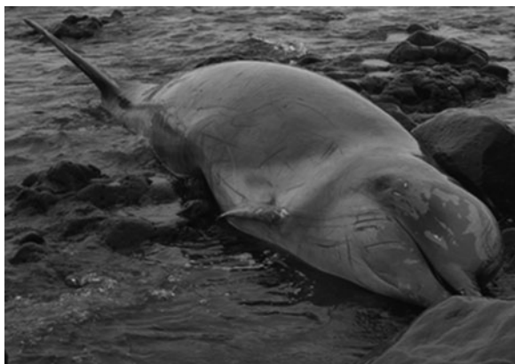
Fig. 1. A juvenile male Tasmacetus shepherdi stranded on Tristan da Cunha, 13 January 2012.

Beaks were identified by comparison with material in the Port Elizabeth Museum (PEM) cephalopod beak collection and using literature (Clarke, 1986; Xavier & Chérel, 2009). Effort was focused on lower beaks for identification and measurement (Clarke, 1986). Lower beaks were counted and measured and morphometric relationships in the literature or developed at the PEM were used to estimate the dorsal mantle length (DML) and masses of each one using the rostral length (RL) for squid (Clarke, 1986).