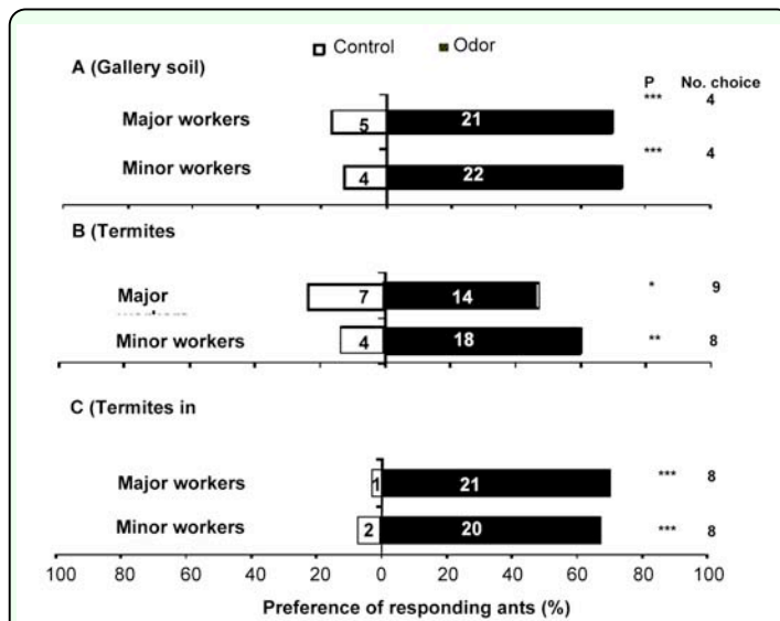
Figure 1. Preferences of Pachycondyla analis major and minor workers for odors from: A. Odontotermes sp. gallery soil; B. Odontotermes sp. workers and soldiers; and C. Odontotermes sp. and gallery soil when presented alongside clean air. Black bars represent response to odors, white bars represent response to the control. Numbers within bars refer to the number of ants making a choice, and numbers outside bars refer to ants that made no choice (N = 30 each for major and minor workers in each test, * = significant at P < 0.05 and *** = significant at P < 0.001 ). High quality figures are available online.