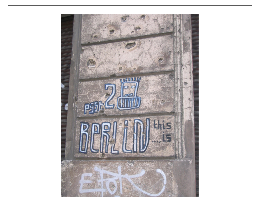
Figure 1.