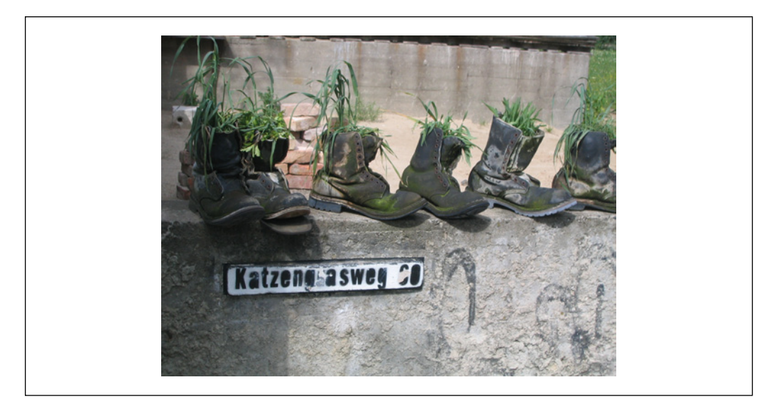
Figure 21.

These thoughts bring us to the conclusion that the city is a work of art, a Gesamtkunstwerk, in which the urban actors as the writers of their own city create not only their surrounds but themselves to boot (Figure 22).