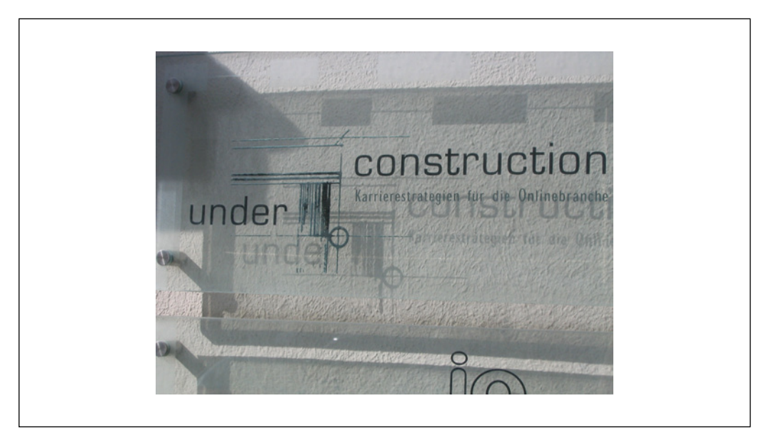
Figure 20.

be formed; at the same time, the semiotic only becomes visible as its surges up within the fabric of the symbolic that has repressed it. Likewise, for Saussure and the early archaeological Foucault, langue and the rules of discourse make possible parole and statements but at the same time, cannot be identified separately from the paroles and statements they generate. Lipietz (1997) points out, similarly, that structuralism, which has imagined the language as speaking the subject, has forgotten that the language itself is dependent on subjects for its own existence—were it not to be spoken by them it would dissolve as surely as the classical languages, and many others, have done (Figure 21).