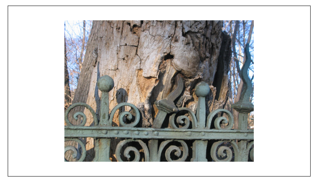
Figure 8.

agency of writing dovetails with the politics of self-making and -remaking and with the politics of urban transformation. I make an attempt at this task, albeit in an experimental, fictive-visual mode, in this article (Figure 8).