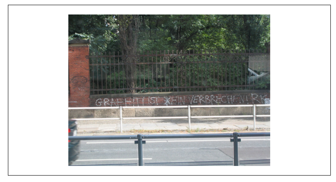
Figure 29.

the city," "The right to the city is far more than the individual liberty to access urban resources: it is a right to change ourselves by changing the city" (Harvey, 2008, p. 23; see Figure 28)