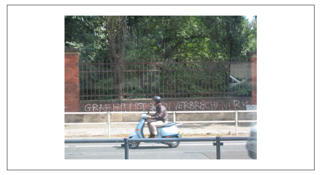
Figure 25.

The asterisk, which is added to the article as a typographical supplement, as a perverted K, also expands the article into a negation and thus by the same token, shrinks its import to zero. Curiously, the unmarked version is coded negatively, while the marked version is coded positively, thus imitating a re-coding of graffiti itself from a negatively coded marking of urban space to the positive reworking of the naked masonry (Figure 26).