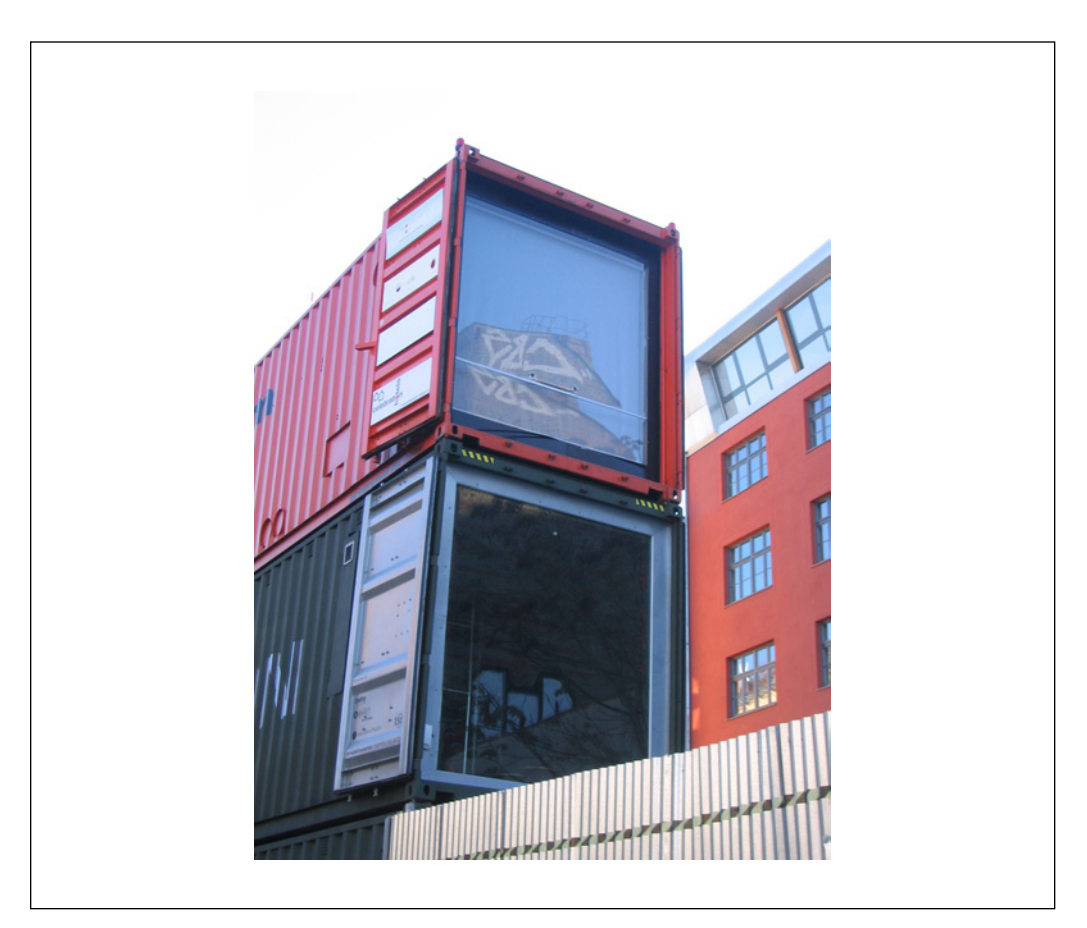
Figure 18.