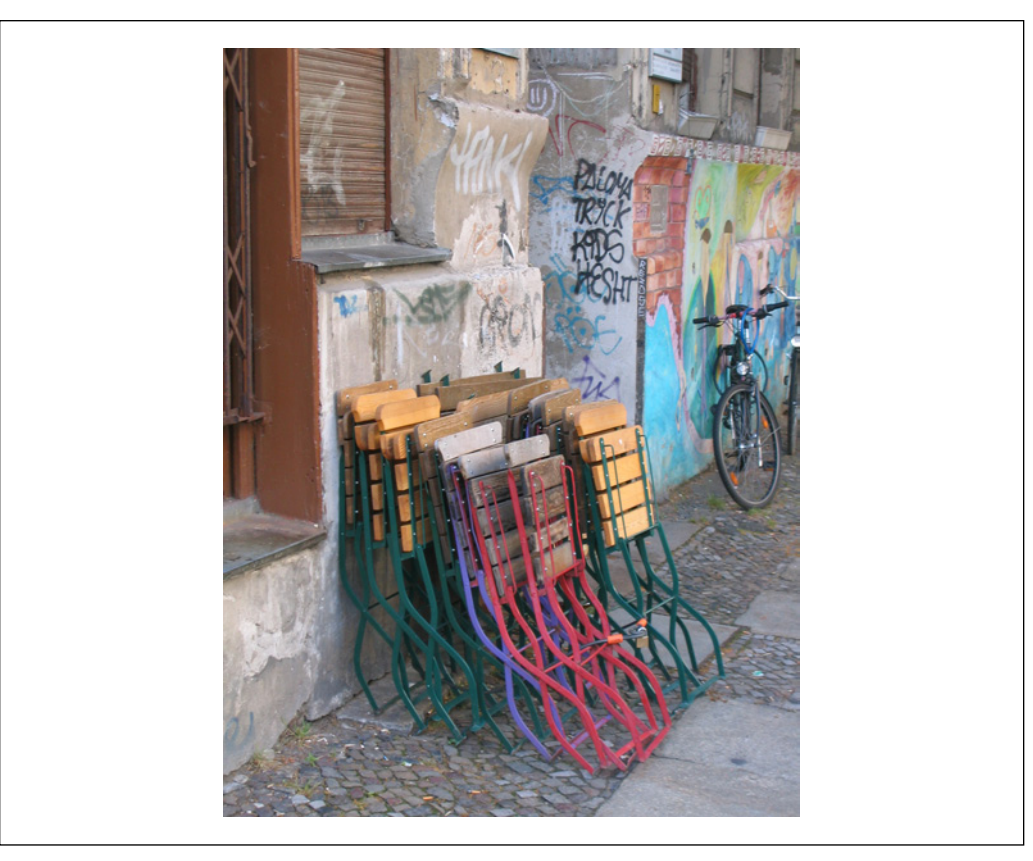
Figure 22.