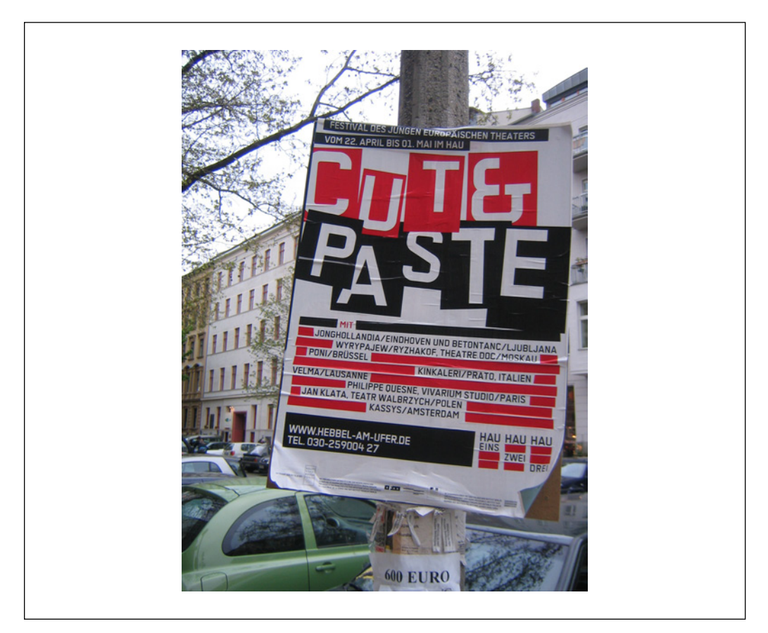
Figure 10.