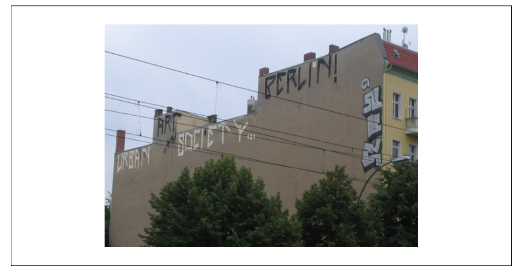
Figure 15.

citizenship—or perhaps the practice that founds and constitutes it— is likewise a concrete one. Rather than the passport, the number plate, or the tax form, which is the code by which we attach ourselves to the nation-state, I submit that other codes, more material and more earthy, mediate the identity of the urban citizen within the less distant fabric of the city itself. As an icon of this grounded citizenship, I propose the figure of the graffiti artist as the locus, which epitomizes the practices of local identification constituting urban citizenship (Figure 14).