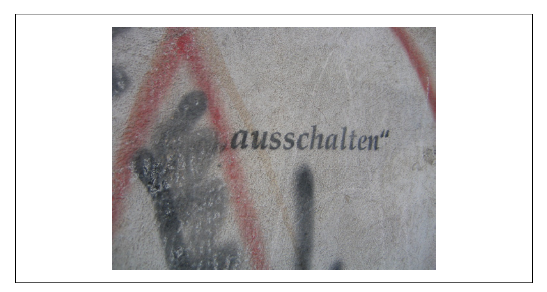
Figure 27.

continuing the oscillation at the meta-level of complete erasure, the occlusion of the offending article. Indeed, the urban space itself is revealed as an unstable space by the passage of the motor-cyclist. The cemetery wall is not the background on which script and passerby are imposed; rather, it is one surface of a folded urban fabric, whose own contours are altered by the interventions of script and subject, just as they in turn are inflected by its own imbrication in the common urban textility.