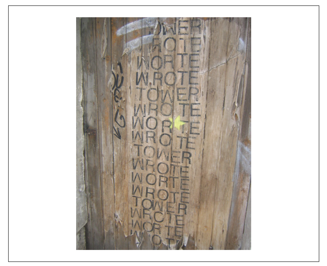
Figure 31.

the city were bedecked with an ever-increasing number of political posters. The author he quotes, Alfred Delvau, refers to the walls of Paris at this time as "murailles revolutionaries," revolutionary walls (Benjamin, 1982, Vol. 1, p. 240). The walls of the city had become a surface of inscription for the insurgent citizens, the palimpsest on which the vox populi expressed itself. In May 1968, spray cans would replace posters, and the venerable walls of the Sorbonne would be adorned with proverbs such as "Défense d'interdire"—it's forbidden to forbid, in a self-contradictory parody of the standard administrative interdiction (Bourg, 2007, p. xi). The revolutionary walls seem today less a site of political change as the site of a political, place-based identity. They are the place where rights are not so much claimed, and created, thereby bringing their creators into being as citizens of the city—as citadins —at the moment they inscribe its folded contextures and in turn are inscribed by them.