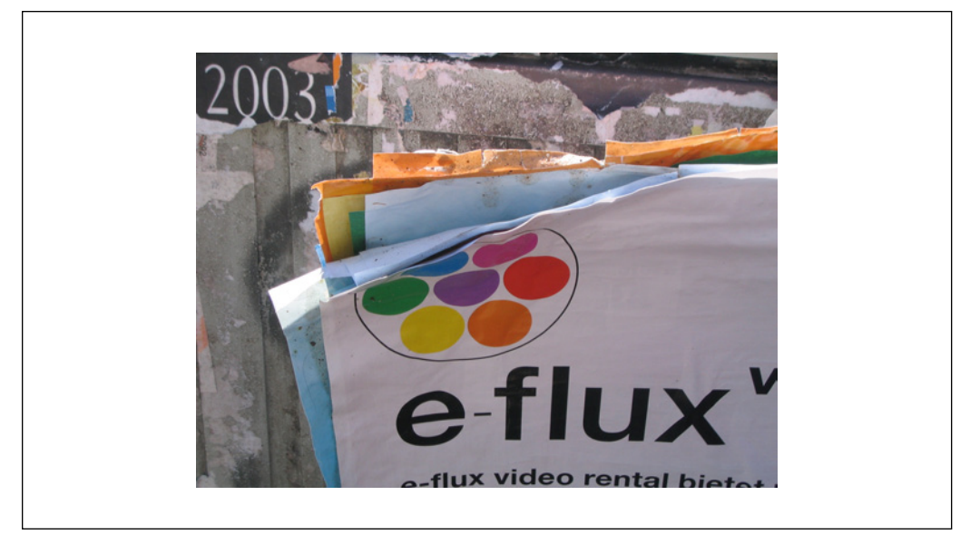
Figure 11.

and installs more fluid transitions between them: "riverrun, past Eve and Adam's, from swerve of shore to bend of bay, brings us by a commodius vicus of recirculation back to Howth Castle and Environs" (Joyce, 1939/1975, p. 3).