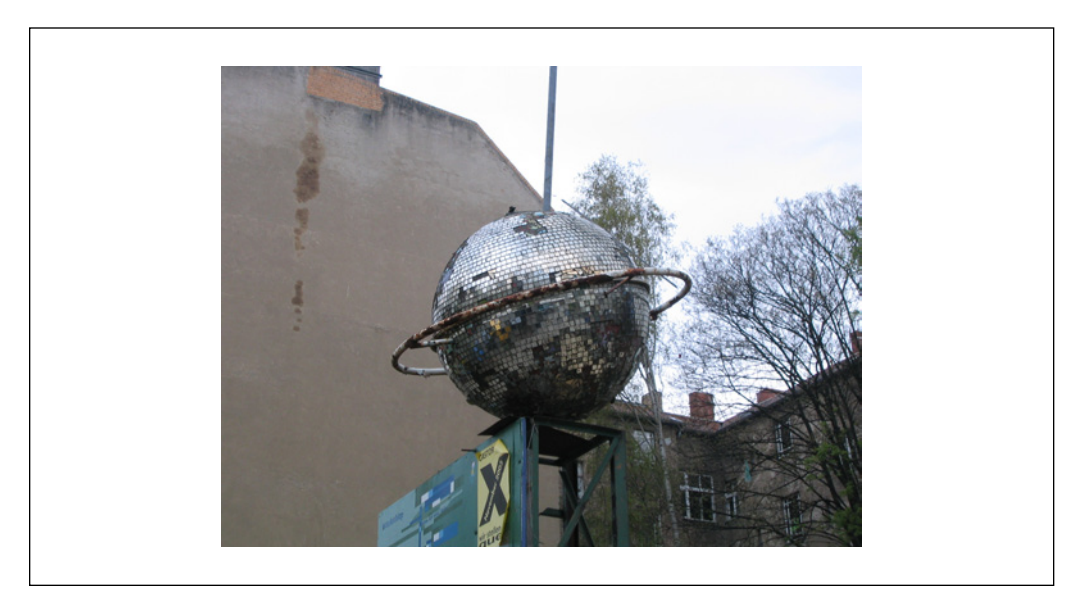
Figure 2.