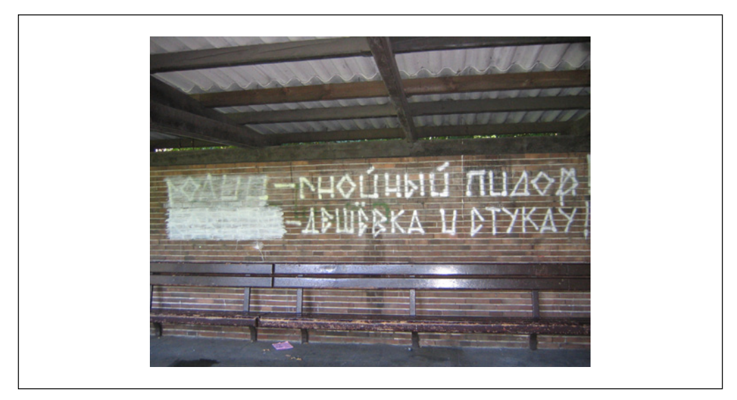
Figure 13.