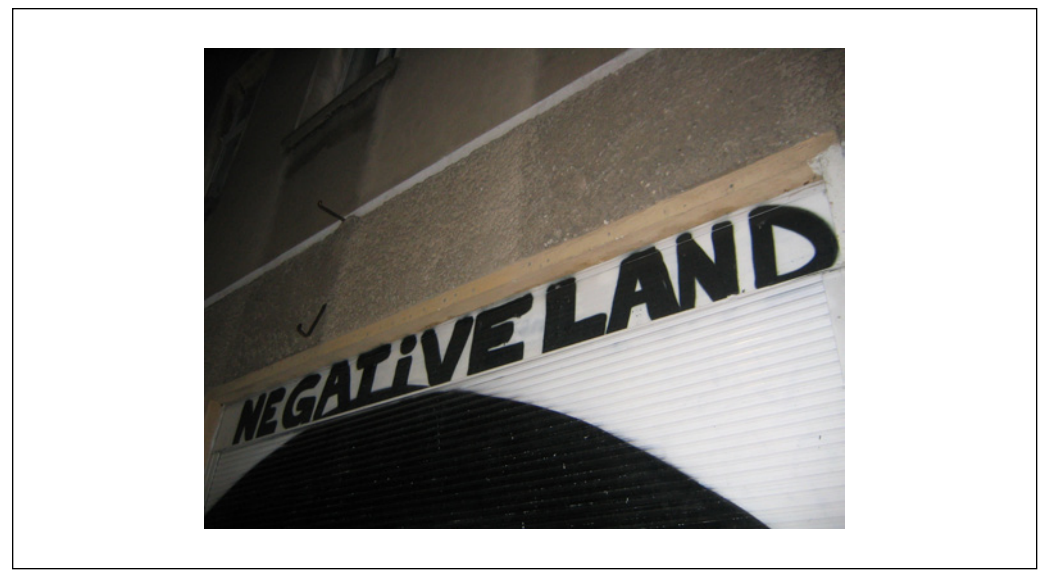
Figure 3.

unprecedented and rapidly spreading degrees of social inequality; the increasing "criminalization" of diverse "marginalities," whether class-, race-, gender-, or ethnic-related (Hage, 2003); new forms of ethnic and cultural violence; varieties of personal and cultural identity, which run at odds to national identities; "border"-syndrome blurring of legal and illegal activities; and statuses (Figure 4).