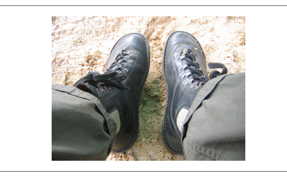
Figure 16.

The photos taken during my own peregrinations across the city should suggest that the city itself in its manifest textuality, in its contexturality, proffers a form of theory equally worthy of attention as that which is promulgated within the walls of the university (Figure 16).