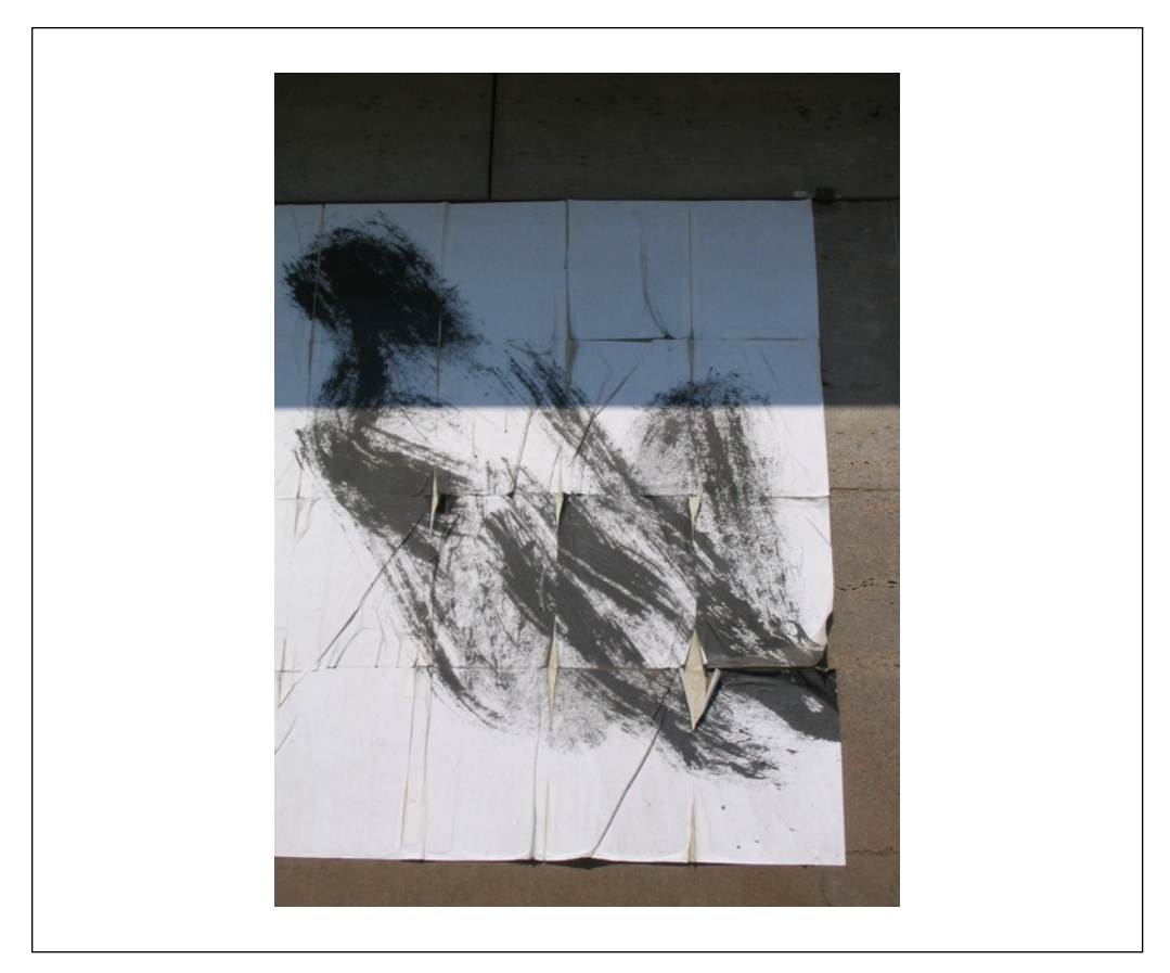
Figure 30.

Second, to posit some hierarchy based in an originary or superior term is to assume that the term is itself fixed, which predicates the possibility of change on an unchanging framework, whereas the framework itself may be quite contingent, indeed, equally in need of radical change. To posit the city as the fixed ground of urban citizenship is, paradoxically, to fix the very structures that the citizenship aims to transform, thereby foreclosing the processes of transformation that are evoked by that selfsame theoretical imagination.