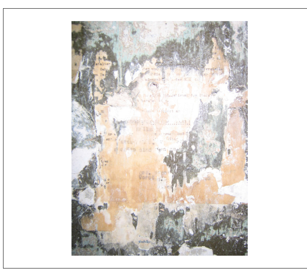
Figure 28.

work of the graffiti artist? What do the ripples of passage and trace, of erasure and highlighting, the folds and waves in this urban warp and woof, reveal about the political agency within contemporary city spaces? (Figure 27).