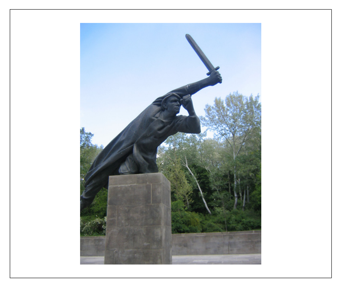
Figure 7. Source: Photo by the author (2005).