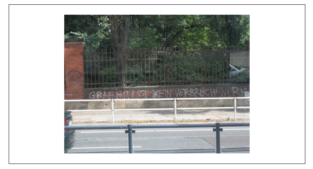
Figure 24.