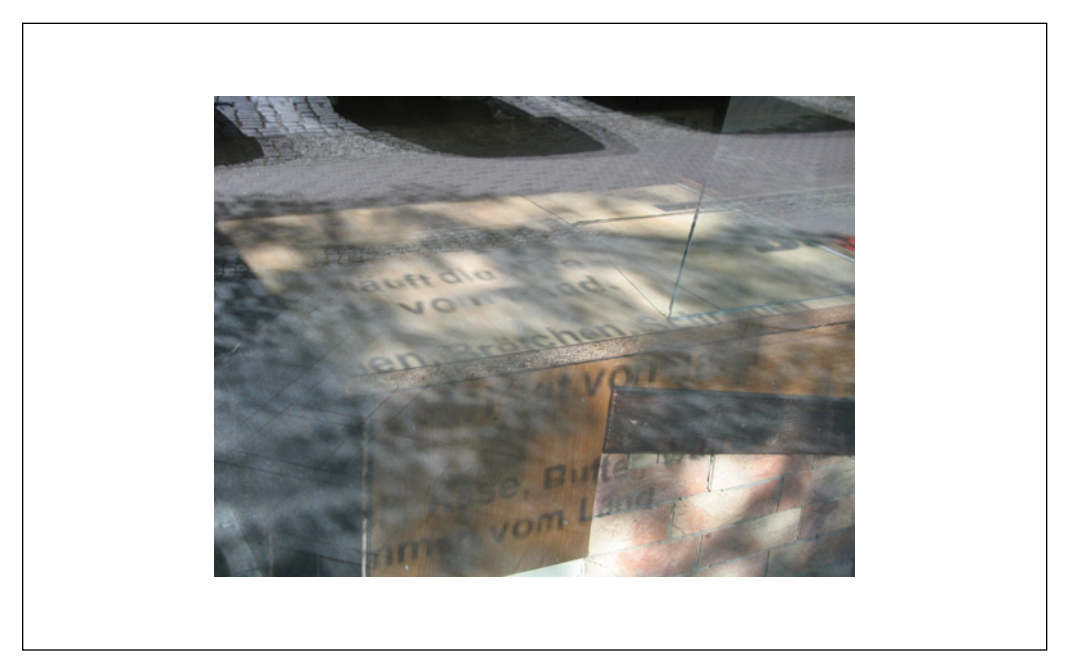
Figure 23.