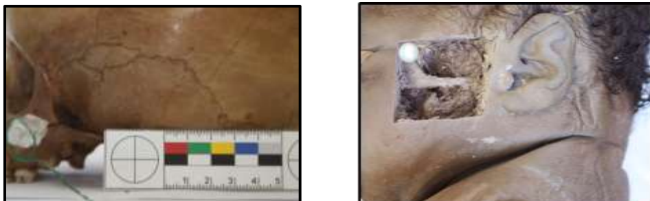
Figure 3: Technique B simulated on (A) a pediatric skull and (B) cadaver

In technique B (Fig. 3A & B), the needle was placed at the frontozygomatic angle and then advanced medially until the pterygopalatine fossa was reached (10).