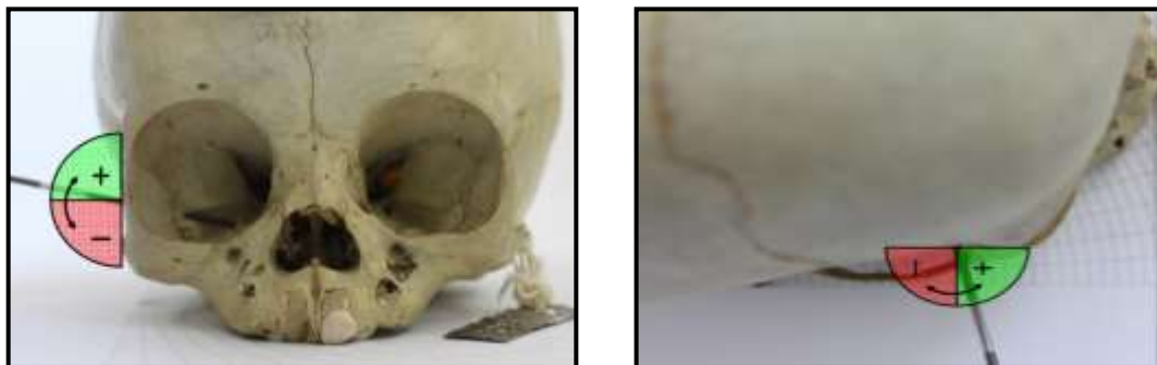
Figure 1: (A) Anterior view and (B) superior views of the pediatric skull indicating the superior / inferior and anterior / posterior angles of the needle, respectively

From an anterior view, the plane perpendicular with the median plane was considered to be 0°. If the needle is angled superiorly towards the pterygopalatine fossa, it will be considered as an increase (+) in the angle while any inferior angling of the needle will be a decrease (-) (Fig. 1A). From a superior view, the perpendicular plane was again considered to be 0° with any anterior deviation seen as an increase (+) and any posterior deviation as a decrease (-) in the angle (Fig.1B).