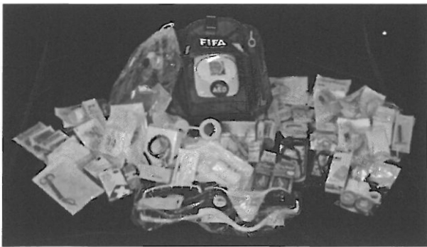
Figure 2 Contents of the FIFA medical emergency bag.