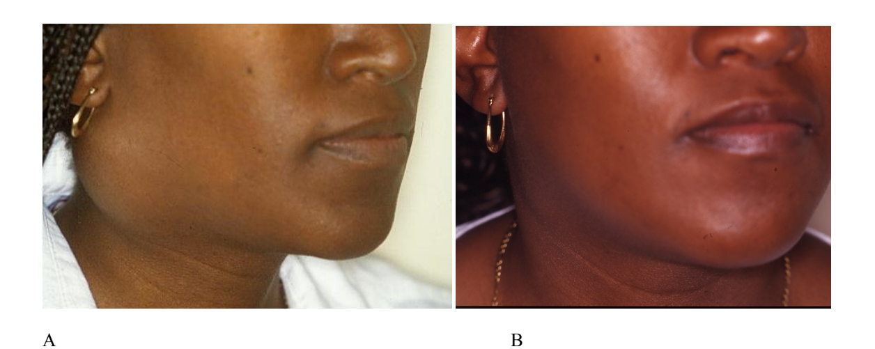
Fig. 2. HIV-related parotid cysts in adult HIV-positive patient: (2A) before HAART, (2B) after HAART.

In the prospective study group (Table 2), all of the 14 selected cases of ranulas displayed a negative result after the first three month period. Neither a clinical reduction in size, nor a modification in radiological imaging of the cystic lesions was observed. There were no differences between simple and plunging ranulas (Figs. 3A and 3B) or between adults and pediatric patients. However, in the subsequent follow-up after the first three month term, ranulas displayed mixed results. Among patients that could not immediately undergo an operation, three