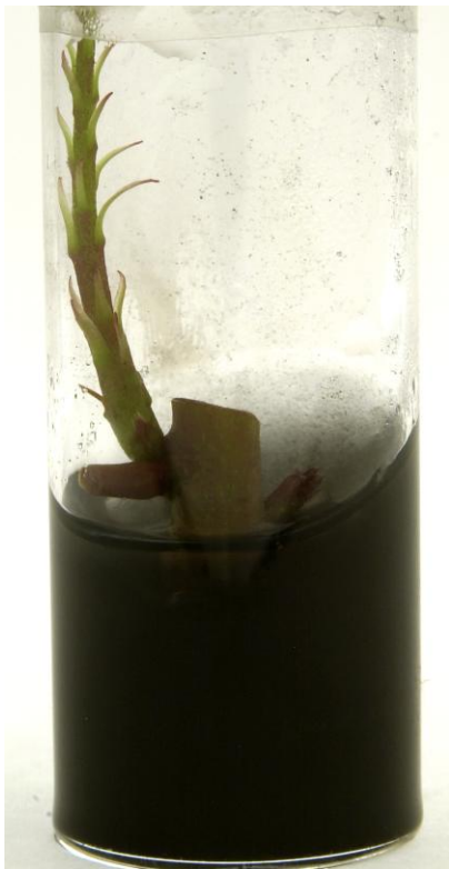
Figure 1. Growth and elongation of axillary bud during establishment of P. cynaroides nodal shoot segment.

plants are propagated in vitro . In a study by Thillerot et al. (2006), the macro-nutrients, with P in particular, were greatly reduced in the growth medium used to propagate Leucospermum (Proteaceae). Similarly, success was achieved by using reduced Murashige and Skoog (MS) (Murashige and Skoog, 1962) macro-nutrients and full strength micro-nutrients to propagate Protea repens (Rugge, 1995) and Telopea speciosissima (Seelye et al., 1986).