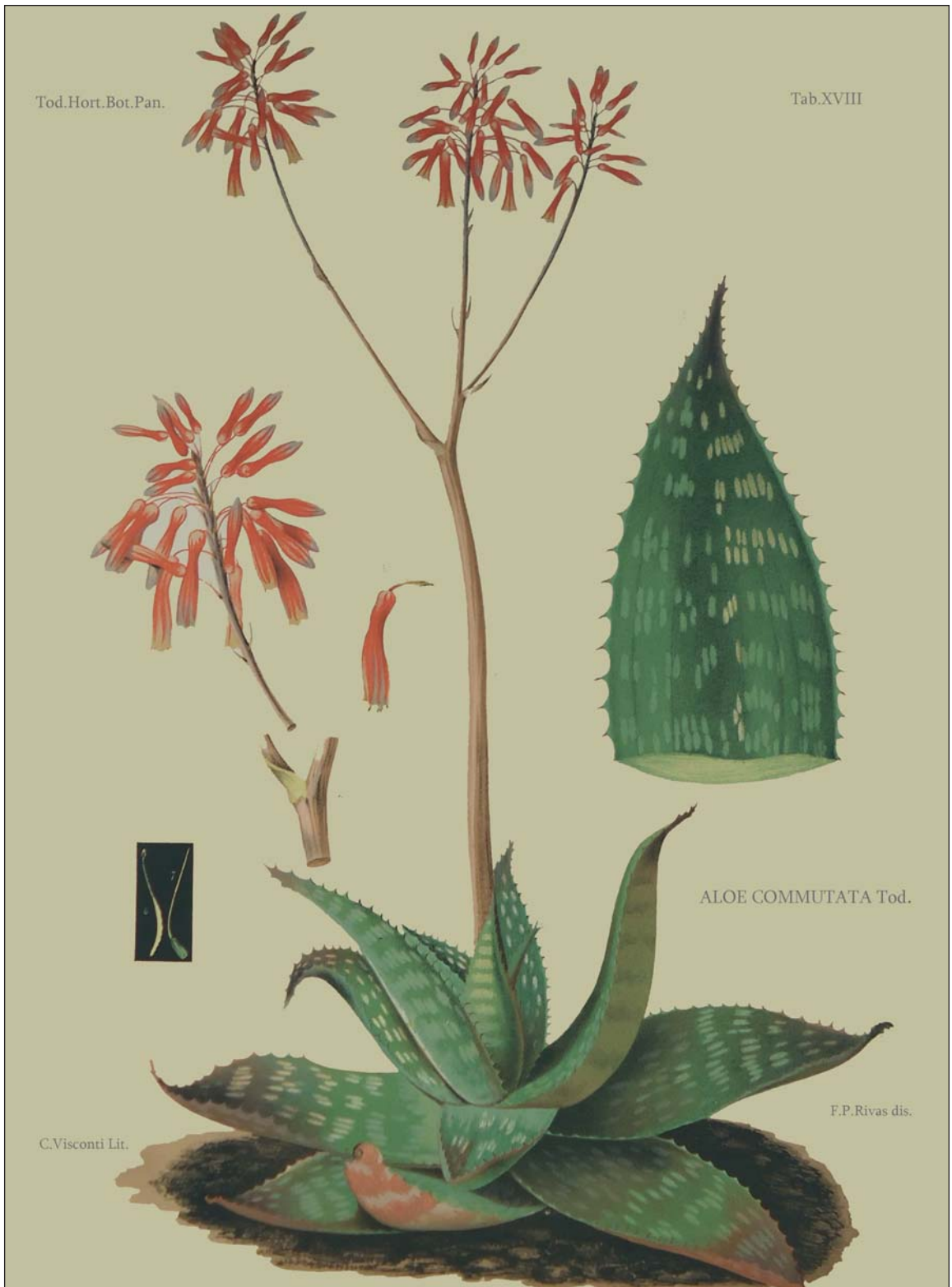
Figure 6. Colour plate of Aloe commutata (Todarò, 1876–1878: t.18).