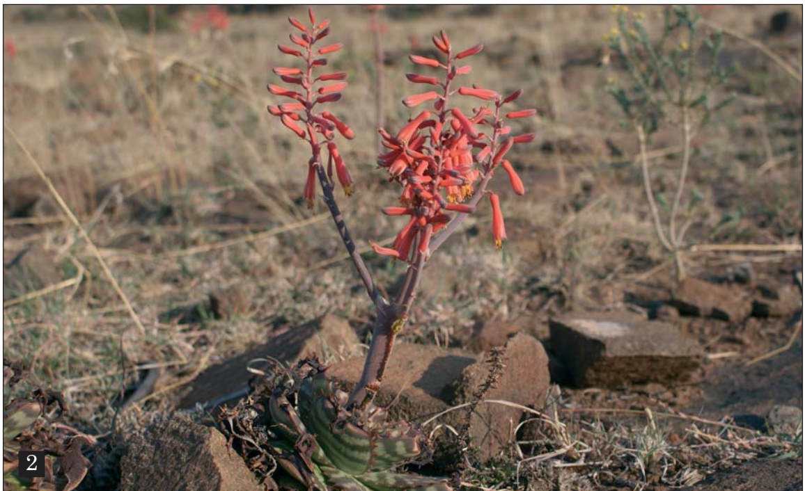
Figure 1. The flowers of A. maculata are longer than those of A. grandidentata , and have a prominent basal swelling. The flowers are usually uniformly coloured and in most forms the lower leaf surfaces are milky green rather than spotted. Figure 2. Aloe grandidentata in its natural habitat near Winburg in the Free State province, South Africa. The leaves of this species have maculations on both surfaces, and the tepals are white-margined. At this locality it occurs sympatrically with A. maculata .