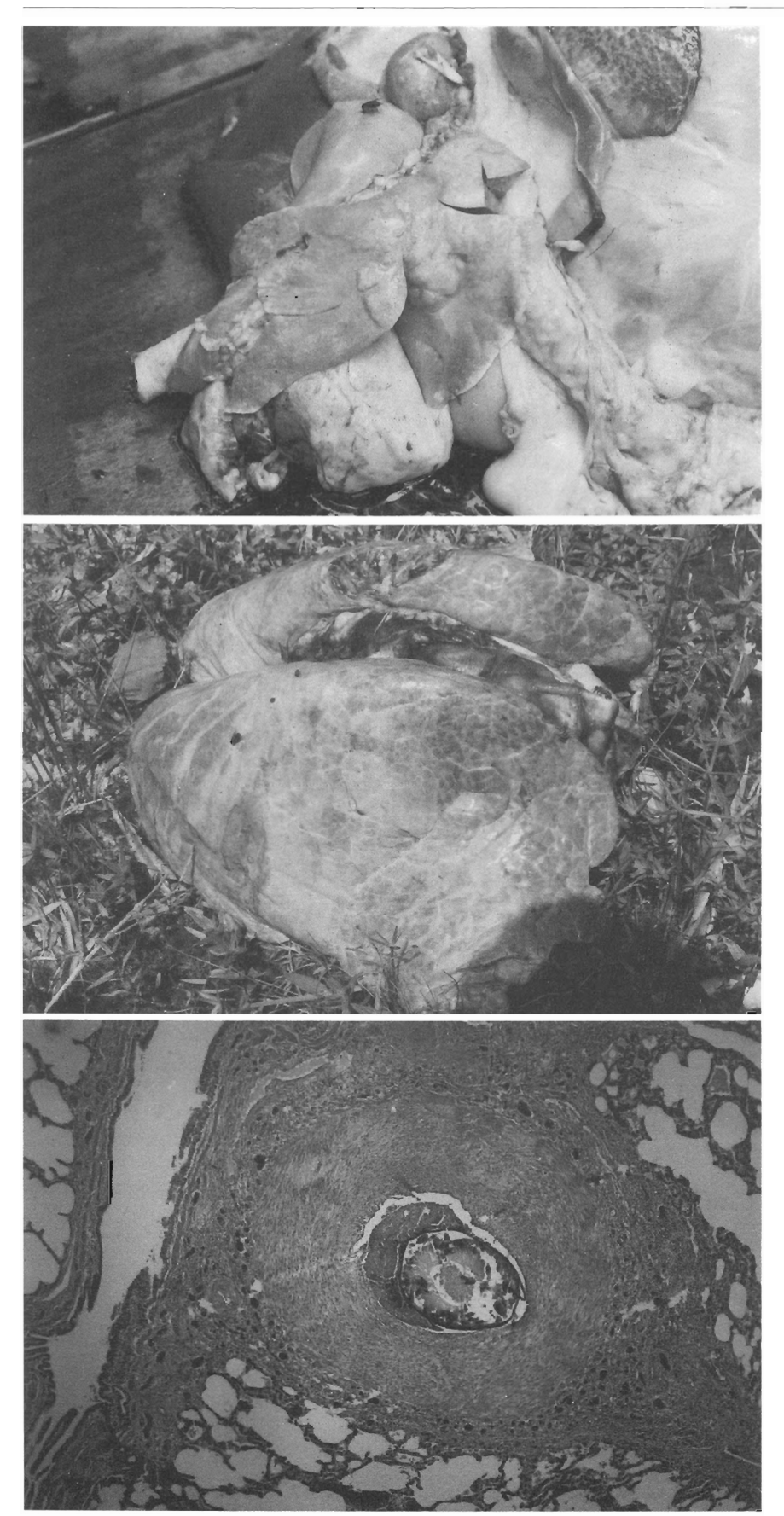
FIG. 5 Emphysematous lesions of in the lung of the village sheep B5

Mortality in bongos and wild ungulates in the Congo Republic