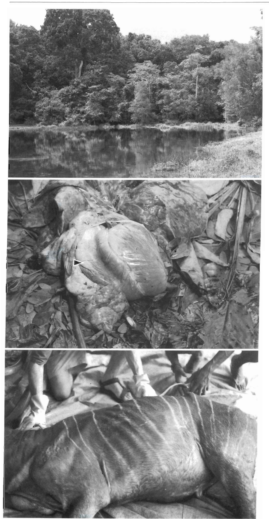
FIG. 2 Bongo habitat at Wali Baï close to Bomassa camp

Mortality in bongos and wild ungulates in the Congo Republic