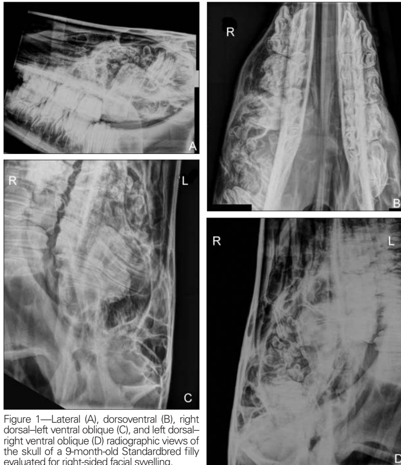
Figure 1—Lateral (A), dorsoventral (B), right dorsal-left ventral oblique (C), and left dorsal-right ventral oblique (D) radiographic views of the skull of a 9-month-old Standardbred filly evaluated for right-sided facial swelling.