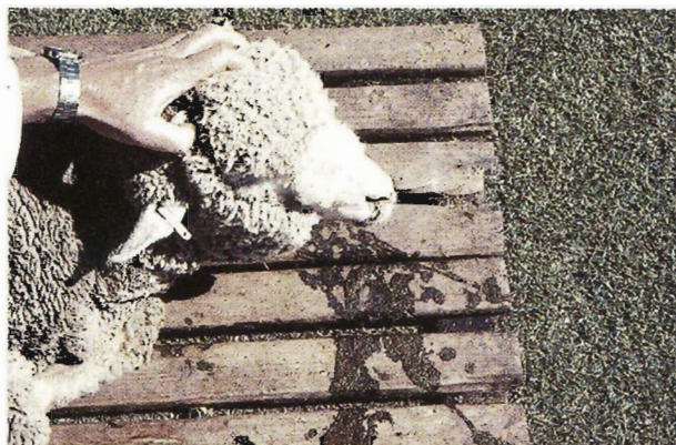
FIG. 2 Vermeersiekte: regurgitation of ingesta

to avoid tall larkspur for three years (Ralphs 1997). However, averted animals had to be grazed separately from non-averted animals as the induced aversion would be broken down by the social influence of non-averted peers (Ralphs & Olsen 1990; Provenza & Burritt 1991; Ralphs et al. 2001). This means that conditioned feed aversion has no application to communal grazing systems with sheep of various owners grazing together, mostly on an uncontrolled basis.