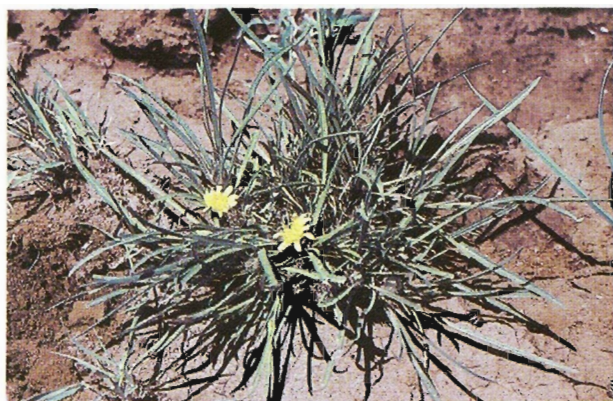
FIG. 1 Vermeerbos ( G. ornativa ) plant