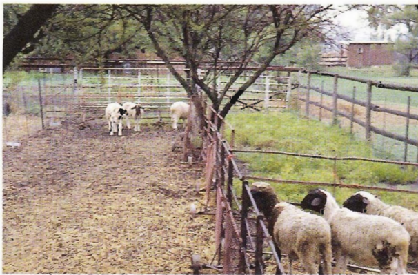
FIG. 5 Averted (right) and non-averted (left) sheep at the end of the trial (day 46)