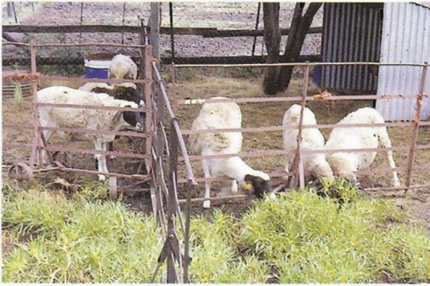
FIG. 4 Averted (left) and non-averted (right) sheep at the start of the trial (day 4)