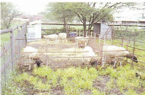
FIG. 6 Averted (at the back, not grazing) and non-averted (in front, grazing vermeerbos) sheep exposed simultaneously to the same vermeerbos grazing

that all accessible vermeerbos plants within the 0.5 m strip on the other side of the framework had been grazed down. Consumption of the aversive mixture was measured and replenished on a daily basis. Both groups received Eragrostis curvula hay and water ad lib .