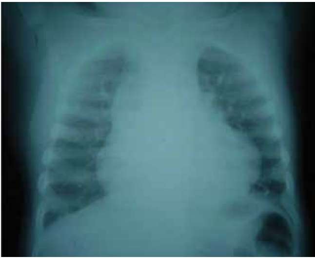
Fig. 1. Chest roentgenogram showing a boot-shaped heart, differential perfusion with increased perfusion to the left lung and reduced perfusion to the right lung.