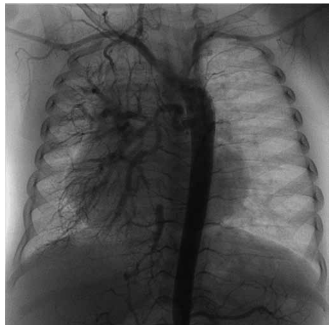
Fig. 4. Descending aortogram in antero-posterior view showing the aberrant right subclavian artery arising from the descending aorta distal to left subclavian artery. The major aorto-pulmonary collateral vessels to the right lung can also be seen.

addition, numerous major aorto-pulmonary collateral vessels were seen arising from the descending aorta, and the ascending aorta arched to the left (Fig. 2). The central pulmonary arteries were not visualised.