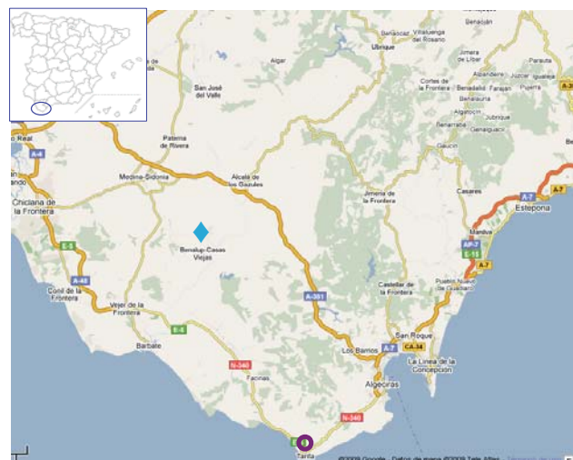
Figure 2. Epidemiologic situation for bluetongue virus (BTV) in Spain, July–August 2007. The first BTV-1 case in Spain was reported in Tarifa (purple circle), only 60 km west from a deer farm where the samples were collected (blue diamond).

Regarding EHD, despite the negative results obtained, lack of robust molecular tools for its detection is noteworthy. All available RT-PCRs are based on the sequences of EHD strains that have never been detected in the Mediterranean area.