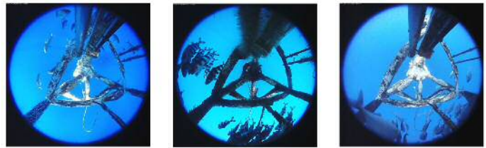
Fig. 2. Pictures taken by the fisheye IP camera attached to the oceanographic buoy showing schools of rudderfish ( Centrolophus niger , left and right) and pilot fishes ( Naucrates doctor , center).

of the EMODNET (http://www.emodnet-physics.eu/portal/) and COPERNICUS (http://marine.copernicus.eu/). These networks are of public access and make available in-situ information for modelling hindcast and forecast providing a social service regarding e.g. the marine weather conditions or the expected circulation pathways in case of environmental emergencies, related to the field of operational oceanography.