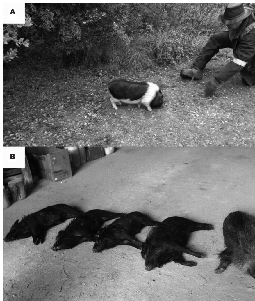
Fig. 1. A. A docile Vietnamese potbellied pig captured by a hunter in a wild environment within northern Spain (ID 3 in table 1 and fig. 2); B. Four potential hybrids between Vietnamese potbellied pigs and wild boar (on the left of the picture) killed during a hunting day in northern Spain (ID 1 in table 1 and fig. 2). The morphological aspect of reported hybrids differs notably to that of young wild boar (on the right of the picture).

Fig. 1. A. Un cerdo vietnamita dócil capturado por un cazador en un entorno natural del norte de España (ID 3 en la tabla 1 y en la fig. 2); B. Cuatro posibles híbridos entre cerdos vietnamitas y jabalíes (a la izquierda de la imagen) cazados en el norte de España (ID 1 en la tabla 1 y en la fig. 2). El aspecto morfológico de los híbridos observados difiere notablemente del de los jabalíes jóvenes (a la derecha de la imagen).