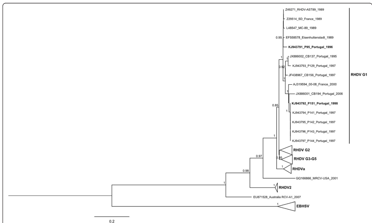
Figure 2 Maximum Likelihood (ML) tree of the capsid gene VP60 for Lagovirus . Only bootstrap values \geq 0.85 are shown. In order to facilitate visualization, major groups are collapsed, with the exception of the group containing the specimens analyzed in the study. The sequences retrieved from GenBank database for this analysis have the following accession numbers: KF494918, KF494921, KF494922, KF494924, KF494930, KF494932, KF494936, KF494943, KF494947, KF494950, KF494951, GU373618, EF558580, M67473, EU650679, EU003579, U49726, AF295785, U54983, FR823355, FJ212323, AF402614, EU003580, EF558579, JN851735, AF231353, DQ189078 (sequences from G2); AM085133, EF558576, EF558572, Y15424, EF558574, AJ535094, AJ535092, Y15426, X87607, FR823354, EF558577, EF558585, Y15441, EF558575, KC595270, AY928268, DQ189077 (sequences from G3-G5); AY523410, KF270630, AF258618, EU003582, DQ205345, DQ280493, AB300693, HM623309, EF558581, EU003578, EU003581, EF558583, EF558582, EF558584, JF412629 (RHDVa sequences); HE800529, FR819781, HE800532, HE800531, HE819400, HE800530, KC345612, JQ929052, KC345611 (RHDV2); Z32526, X98002, U09199, KC832838, KC832839, AM408588, AM933648, AM933649, AM933650, AM887765 (EBHSV sequences). RHDV sequences from Iberian hares appear in bold.

The inferred ML relationships were in agreement with those published, with EBHSV, RHDV2 and RHDVa forming well supported groups (bootstrap values of 1; Figure 2). Genogroups 1-5 cluster together, with G1, G2 and G3-G5 also forming well supported subgroups. The tree further shows the inclusion of P95 and P151 in the G1 subgroup: P151 clusters with the rabbit samples collected in the same area (P129 and P141-P144), with the Portuguese strains CB137, CB156 and CB194, dating from 1995, 1997 and 2006, respectively, and with the French strain 00-08 dating from 2000; P95 appears to be more closely related to the older European strains belonging to G1, from Spain, France and Germany. The higher average nucleotide and amino acid identity of P95 and P151 is found with G1 (95.9%-96.6% of nucleotide identity and 97.8%-98.4% of amino acid identity). Furthermore, P151 presents 99.8%-99.9% of nucleotide identity and 100% of amino acid identity with P141-P144.