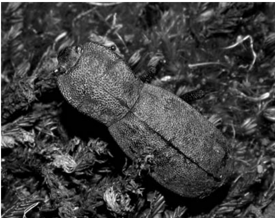
Fig. 1. Habitus of a live specimen of V. aequalis from Tlaquilpa, Veracruz, Mexico.

This interpretation is supported by the distribution range of specimens we have studied, from several localities of the State of Oaxaca including some in the vicinity of Cerro San Felipe. However, the distribution of V. aequalis is not narrowly restricted, but ranges through a great portion of the mountains of northern Oaxaca, along the Sierra Aloapaneca, Sierra Mazateca and Sierra de Juárez, including a small area in the neighboring mountains of Veracruz (Fig. 2). The latter locality represents a new record for the state of Veracruz.