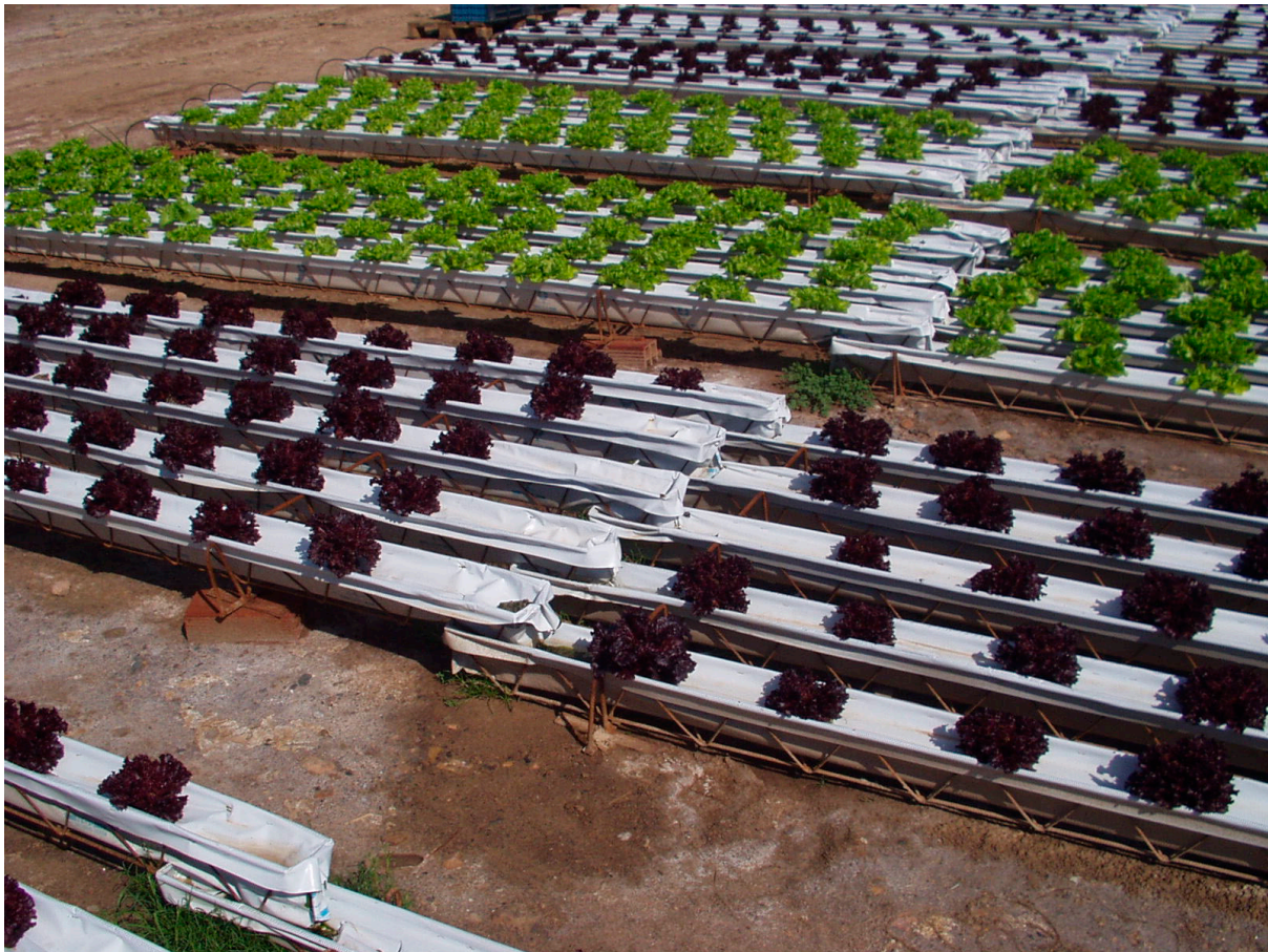
Figure 3. Nutrient film techniques (NFT), a type of soilless systems where a thin film of nutrient solution flows through plastic channels which contain the plant roots and laid on a slope in order to grant the constant flow of nutrient solution.

Soilless systems, such as hydroponic floating systems [71] or nutrient film techniques (NFT) [72], are being used for leafy vegetables with short production cycles allowing a better control and standardization of the cultivation process (Figure 3). Many advantages have been attributed to the use of soilless systems in greenhouses to produce leafy greens, but reductions in product quality and shelf life have been observed [73] which may limit the use of these systems. However, recent studies carried out in commercial agricultural production sites showed that the use of poor quality irrigation water combined with the use of soilless production systems considerably reduced microbial contamination risks to fresh produce [42,74].