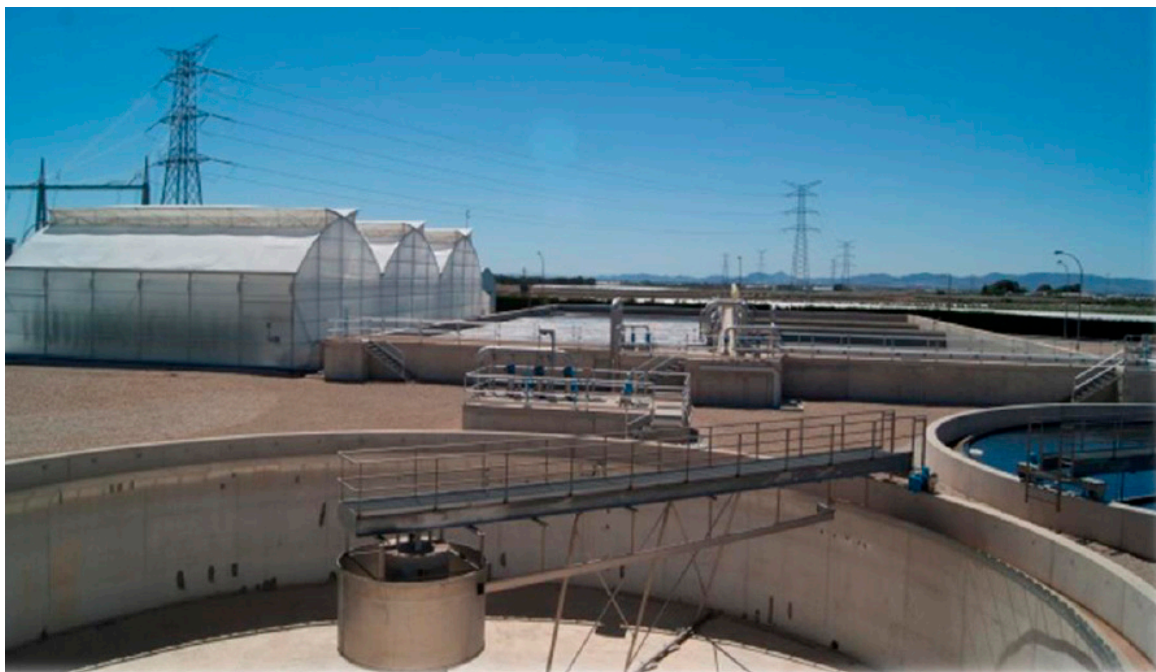
Figure 1. A secondary treatment wastewater plant located in a greenhouse production unit to provide irrigation water for tomato production.

Studies focusing on the microbial quality of reclaimed water used for irrigation reported presence of faecal contamination within the range 2–4 log E. coli cfu/100 mL and also presence of pathogenic microorganisms such as Salmonella spp. [41,42] (Table 1). Production systems that minimize irrigation water contact with the edible portion of the crop seem to reduce the risk of contamination. Codex Alimentarius [43] reported that plants grown in hydroponic systems absorb nutrients and water at varying rates, constantly changing the composition of the re-circulated nutrient solution and because