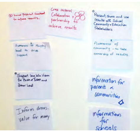
Figure 4: Identifying key themes: PILNA Steering Committee meeting, Nadi, Fiji, 18 August 2015