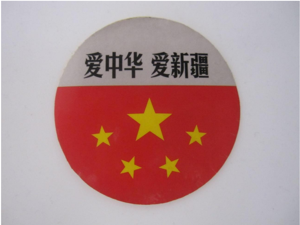
Figure 5.5: Patriotic stickers given out across the city of Ürümchi: "Love China ( Zhonghua ), Love Xinjiang".

wearing the badge. I even had to explain what they were to several Uyghur informants who lived in the south of the city but had not even seen them. This banal nationalism and the boundaries which it elucidates were being performed by Han Chinese and not Uyghurs. Uneven participation in this imagined community reflected the lack of social connections between the north and the south of the city. Uyghurs did not want to be included in these performances of China. This uneven participation also reflected the differing community perceptions of national belonging and the 'China' concept.