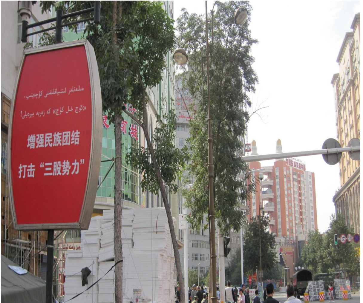
Figure 4.2: Just one example of this slogan erected approximately every 20 yards on Tuanjie Lu ( Tuanjie Street ), with a heavily military roadblock on every junction (see bottom right): “ Jiaqiang Minzu Tuanjie, Daji ‘San gu Shili’ ” (“Strengthen Minzu Tuanjie , Strike Hard against ‘The Three Evils’”).

Han-centric visions of social order are not limited to the domestic level in official Chinese policy discourse. “Harmony through diversity” ( He er butong ) has been at the centre of Hu Jintao’s “harmonious world” foreign policy and his answer to the “clash of civilisations”. Hu’s “harmonious world” approach thus intensifies the re-inscription of difference but this is a pluralism of sovereign states rather than a plurality of publics (Kerr, 2011, p.171-172 & 175). Harmony, or harmonisation, is thus a nationalist drive to make identity congruent with the PRC’s sovereign borders. The party-state’s approach to identity-security in Xinjiang and international relations was exemplified through the complete closure of the internet and international phone calls for approximately 10 months after the violence of July “to prevent unrest” (Xinhua, 2009). The physically external world of international news is thus understood and represented by the party-state as a threat to identity-security. Uyghurs are quarantined from international news to prevent “infiltration” of alternative information from the ‘outside’. Conversely, this approach to security also quarantined the perspectives of Uyghurs from being