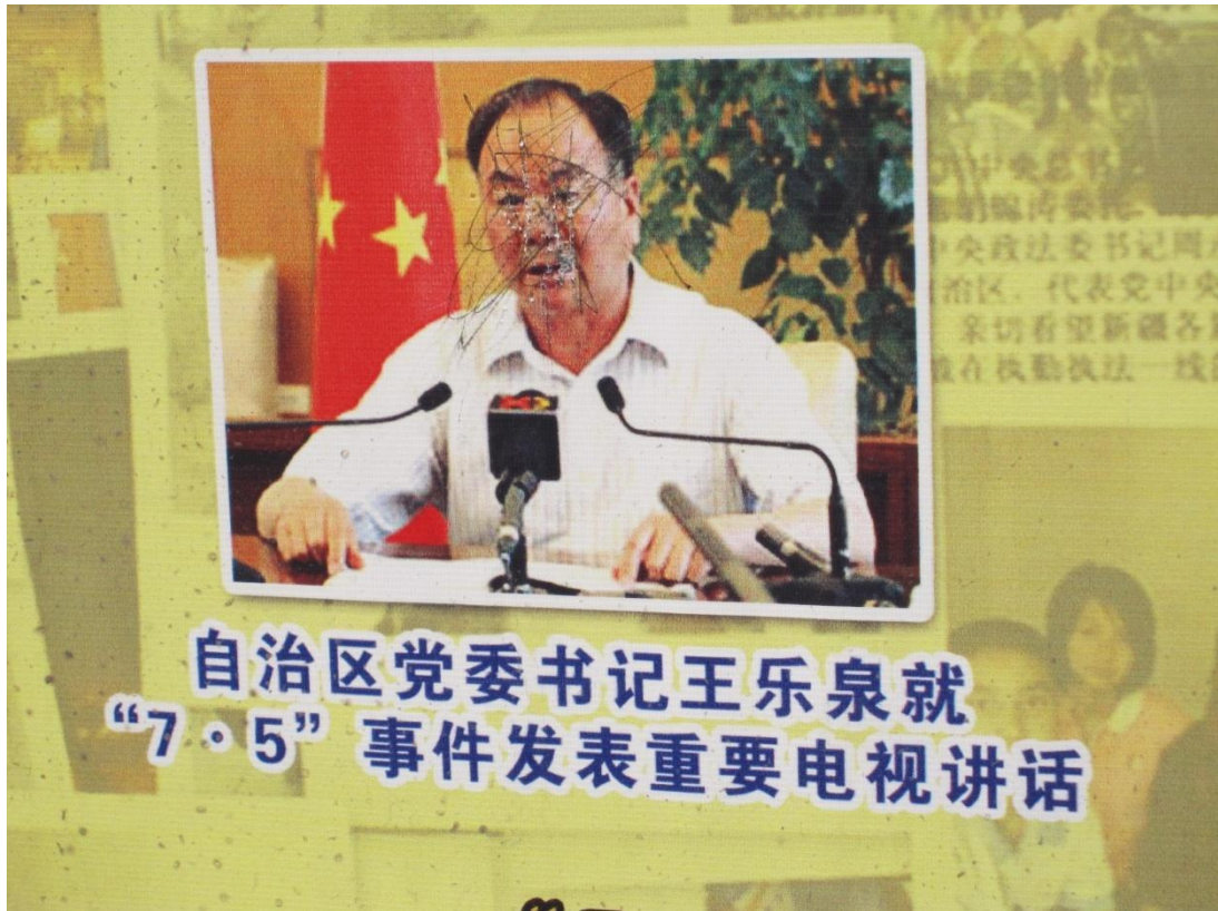
Figure 4.4: "Regional Party Secretary Wang Lequan makes his important speech regarding the '7-5' incident".