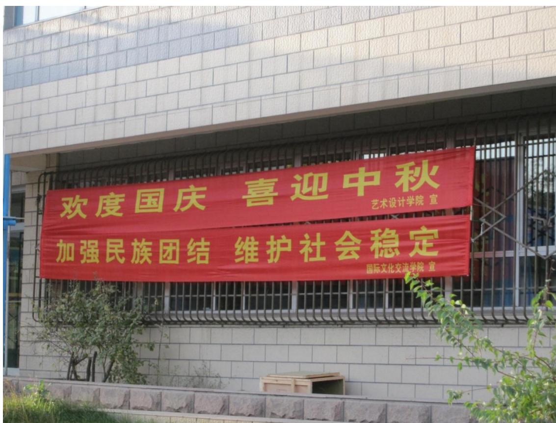
Figure 5.6: Top: “Joyfully celebrate National Day, happily welcome Mid-Autumn Festival”. Bottom: “Strengthen Minzu Tuanjie , protect social stability”.

centred structure of China was formally performed at Xinjiang University on the 30 th September, 2009. Staff formally distributed the “love Xinjiang, love China” stickers to each and every student in every class on the 30 th September. 120 This was accompanied by a brief explanation that it was important to celebrate national day and minzu tuanjie , assuming that unity and Chinese nationalism went hand in hand. These stickers were given out to every student along with a mooncake, traditionally eaten by Han for mid-autumn festival ( Zhongqiu jie ). The speeches by heads of departments claimed Mid-Autumn festival and Spring Festival ( Chunjie ) were China’s most traditional and most important festivals. The silencing of non-Han festivals and use of Han festivals as exemplars of the Chinese nation was a conflation of Han-ness and Chinese-ness. The social practices of the majority ethnic group came to represent an entire multi-ethnic nation. This objectivisation could also be seen in slogans raised across the university such as “Joyfully celebrate National Day, happily welcome Mid-Autumn Festival” (see figure 5.6). Engaging in social practices associated with the Han ethnic group is articulated through the celebration of national day, thus a means to become Chinese.