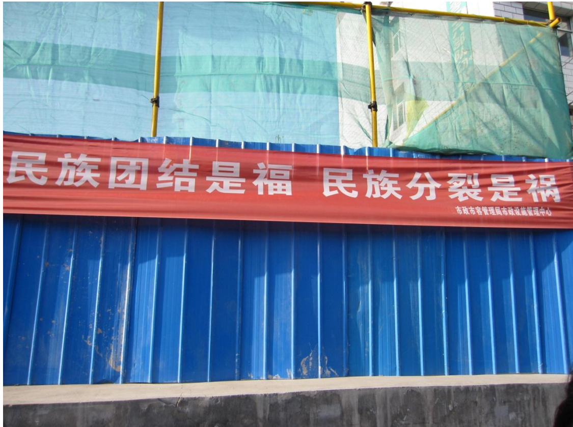
Figure 4.1: A slogan erected by the city government’s planning department supervision centre: “ Minzu Tuanjie shi fu, Minzu fenlie shi hud ” ( Minzu Tuanjie is prosperity, Minzu separatism is disaster).

and passive shaoshu minzu frontier. This challenge transgresses the internal, hierarchical boundaries of Chinese-ness or what Winichakul called the geo-body or the “life of the nation” (Winichakul, 1994, p.11). Nation-building was proceeding through the representation of the violence of July 5 th in such ways that the exclusionary character of the discourse was producing what it meant to be secure – modern, Chinese, and Han-centred.