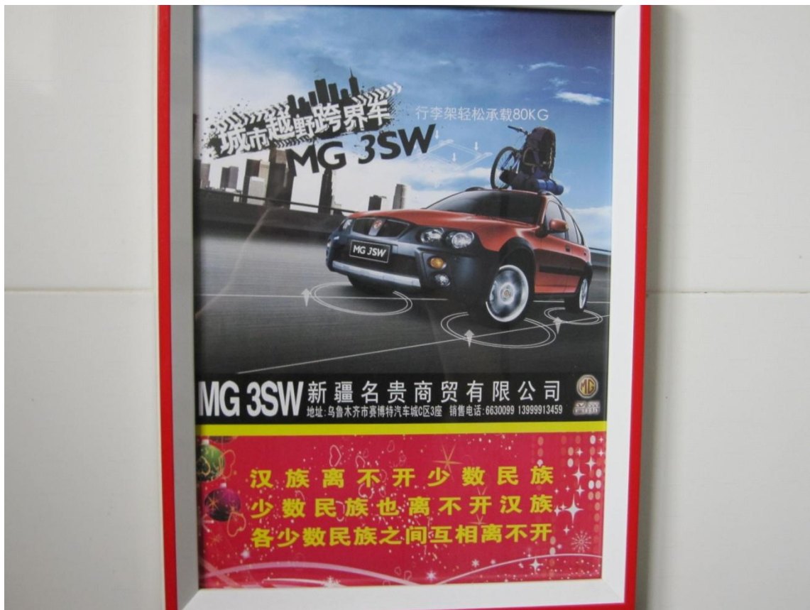
Figure 5.1: “The Han can never leave Shaoshu Minzu , Shaoshu Minzu can never leave the Han, and all Shaoshu Minzu can never leave each other”.

In Xinjiang, news broadcasts, school textbooks, and political slogans analysed in previous chapters are saturated with the discourse of minzu tuanjie in such a way that it is “everywhere” in the sense Foucault (1991) intended in Will to Knowledge . Understanding minzu tuanjie thus requires we look beyond the ‘high’ politics of party conferences and explore the texts which people encounter in the ‘low’ politics of the everyday. One textbook used in minzu tuanjie classes explains that one of the key precepts of minzu tuanjie is Jiang Zemin’s concept of “The Three Cannot Leaves” ( sange libukai ). The concept of sange libukai emerged prior to the Cultural Revolution. Following its disuse, Jiang Zemin re-introduced the idea during his 1990 visit to Xinjiang. It now appears in all party documents and educational materials on ethnic relations: “The Han can never leave Shaoshu Minzu , Shaoshu Minzu can never leave the Han, and all Shaoshu Minzu can never leave each other” (see figure 5.1). In this case, the advert for “boundary-crossing” MG Cars appeared alongside the “three cannot leaves” in a urinal in an Ürümchi coffee shop. The Han and minorities are imagined as one indivisible national geo-body. The everywhere-ness of this discourse can be seen where identity politics and commercial advertising appear not only in competition for public space but alongside and merged into another.