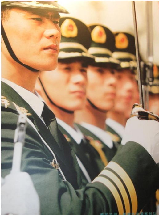
Figure 5.3 (left): “The mighty army – the troops of Xinjiang’s People’s Armed Police”.