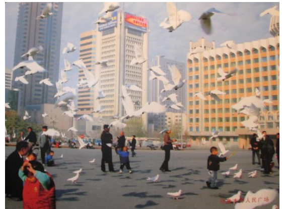
Figure 5.4 (above): “Ürümchi People’s Square”.

Differences in the celebration of national unity between Han and Uyghurs were observed at this time. One such difference, which remained for months across the city, was the unequal adornment of an “I love China, I love Xinjiang” stickers and badges (see figure 5.5). The stickers were made by the Ürümchi Evening Times (Wulumuqi Wanshibao) to commemorate the 60 th anniversary of the founding of the PRC. The newspaper explained that the anniversary had “raised the self-confidence of the Chinese family and exhibited the greatest opportunity of the new China’s great achievements” (Wulumuqi Wanshibao, 2009). The idea of these symbols was to “wish happiness on the great motherland and a more glorious future for our beautiful Xinjiang” (Wulumuqi Wanshibao, 2009). Furthermore, the distribution was claimed to be a response to the popular demand of residents. The newspaper explained that since the violence of July, “every member of the Chinese family” “wanted to express their warm love and blessings for the motherland”; “all children of every minzu will all feel pride and self-belief because they are Chinese” (Ürümchi Evening Times, 2009). The stickers thus demanded that love of China and of Xinjiang go hand in hand. Their embrace and rejection can then be seen as an indicator of the appeal of Chinese nationalism.