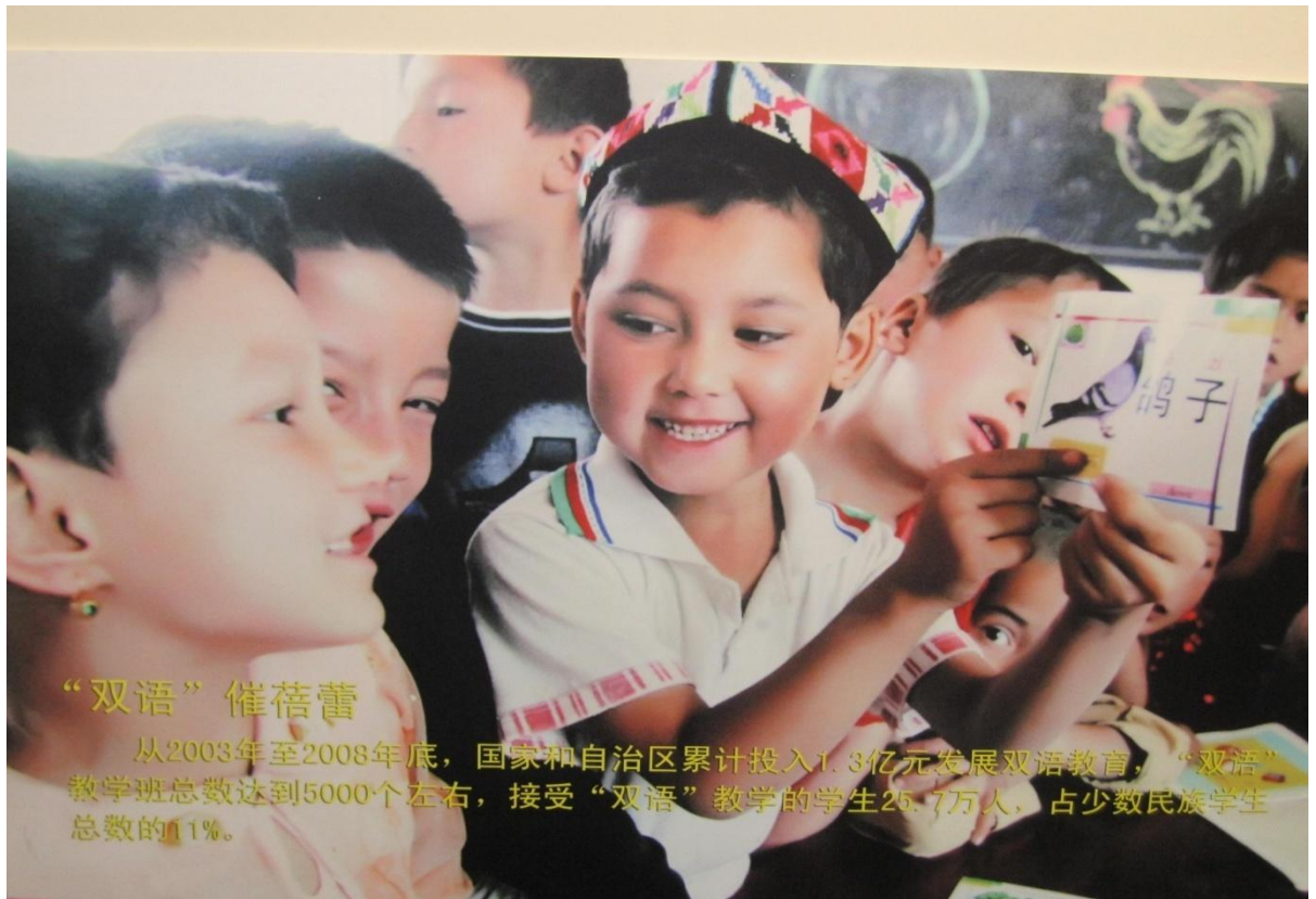
Figure 3.1: "Bilingual Education" Hastens Buds ( Shuangyu Cuibeilei ). This photograph also appeared in the Xinjiang Daily and on the website of the national network with the caption "I can fly" ( Wo neng fei ).

The boundaries of what it means to be Chinese and what it means to be Chinese-Uyghur are demarcated such that everything outside the party-state's narrative is a form of "terrorism, separatism, and extremism". "Mistaken" ethnic identities, defined by reference to minority languages, it is claimed only exist due to this dangerous influence of the "inside-outside" threat of The Three Evils (Ministry of Information 2009b, p.55-59). The party-state is constructing inside-ness by reference to the "constitutive outside" but this cultural outside is inside the territorial boundaries of China. Uyghurs who interpret the arrival of Qing armies as invasion rather than liberation, identify themselves as Turks, or argue for the promotion of Uyghur language education are excluded from the national community by being linked to a threatening past of backwardness and a dangerous outside of security threats. These mutually reinforcing dichotomies define the boundaries of community. They attempt to symbolically construct national community by imbuing historical representation, self-identification, and language use with normative meanings positioned in a social hierarchy.