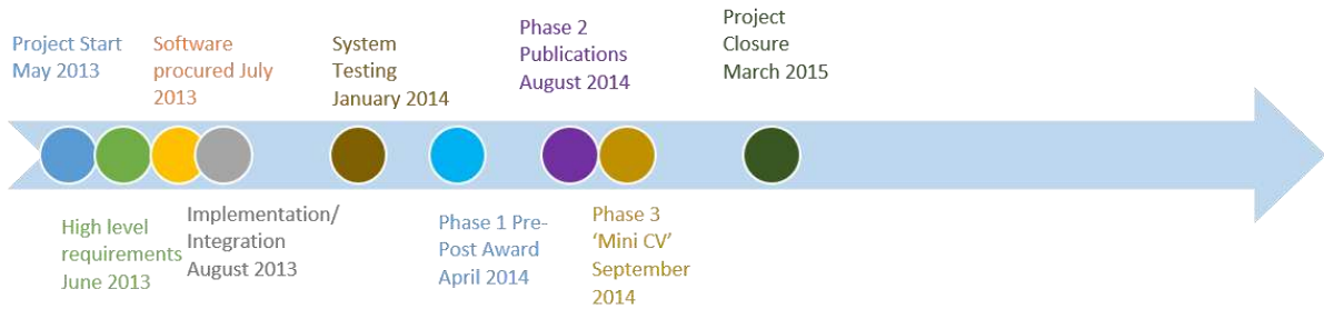
Fig. 2. Initial Project Timeline

company, Thomson Reuters. Initially this coincided with the planned three month testing period and so there was no impact on the project plan. However, in April 2014 and the following few months, it became clear that the company's, originally very responsive, project manager was not delivering the required changes in a timely manner.