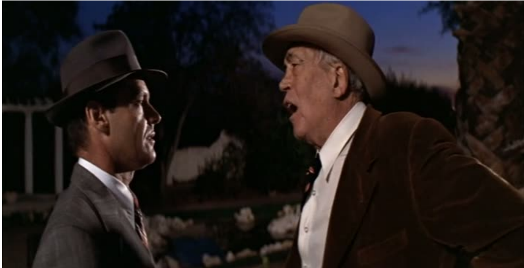
Fig. 7: Jake confronts Noah Cross with his involvement in the murder of Hollis Murray