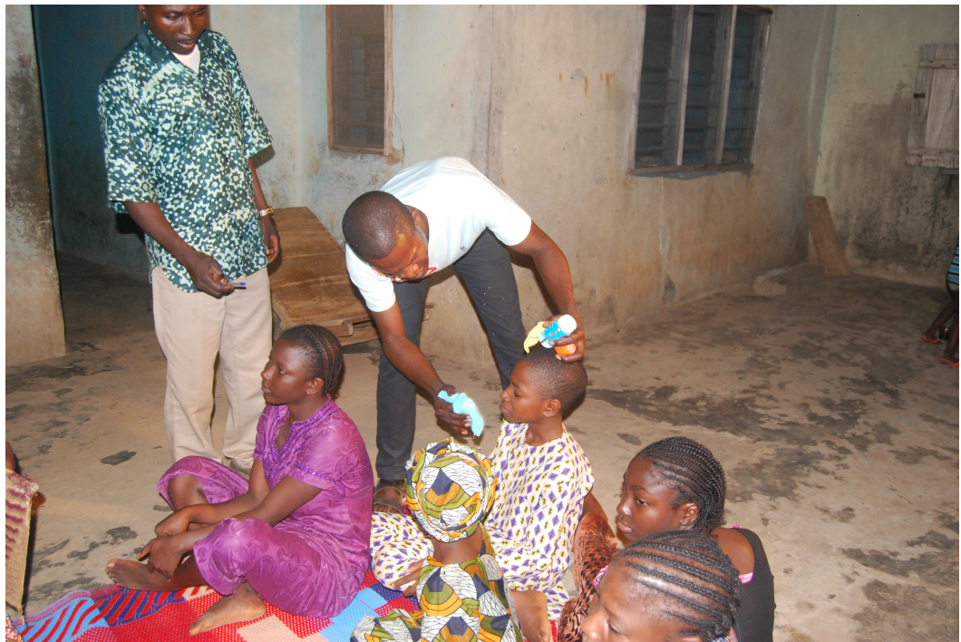
Fig. 25: The make up artistes doing their job on set