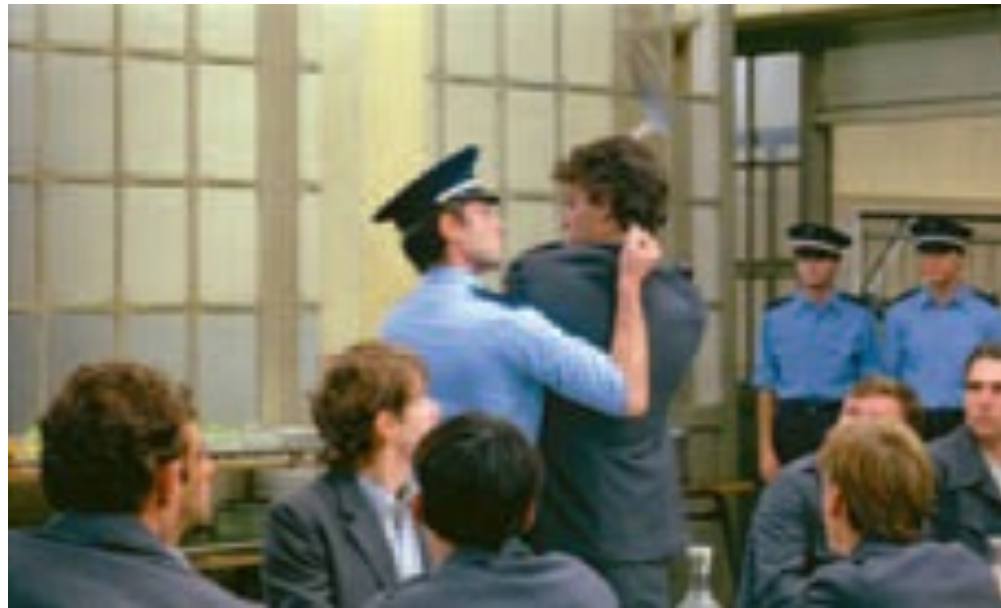
Fig. 19: The colours here resemble those in scene in fig. 16

In L'argent , as well as Pickpocket (France, 1959), empty screen space plays an important role. In the scene where Yvon holds a lantern and axe when he is about to force the door open, the screen is left empty for a while. According to Burch (1973:26), through this approach, Bresson achieves what might be called an orchestration of space, rigorously controlling the moments when the screen is left empty and the duration of these moments and establishing the precise extent of the surrounding off-screen space through his use of sound (the barking of the dog in L'argent ).