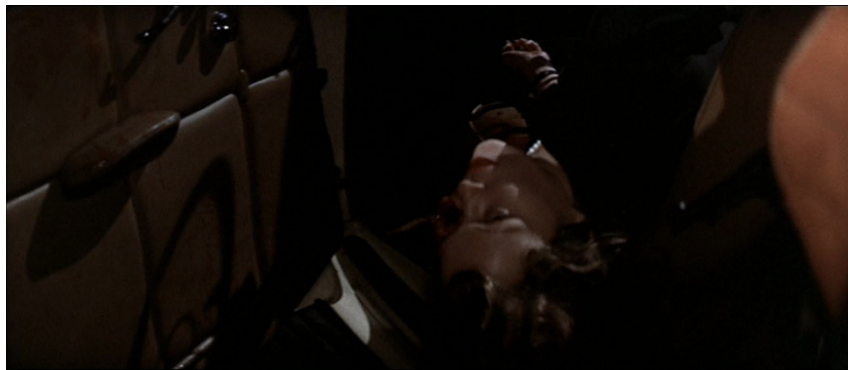
Fig. 5: Evelyn, shot dead by the police

On getting to Chinatown, where Gittes is to help Evelyn and Katherine escape to Mexico, the police who had arrived the venue before the trio, arrest Gittes. When it becomes obvious that Cross is determined to take Katherine from her, Evelyn shoots him and speeds off. In the process, the police shoot Evelyn and she dies, while the car horn blows continuously as her head rests on the car horn. Cross succeeds in taking Katherine away, while Escobar releases Gittes and his colleagues. As Gittes appears lost in the ‘cloud’ of the events, one of his associates reminds him of the futility of doing so by saying, “forget it, Jake. It’s Chinatown”.