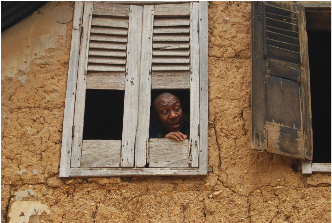
Fig. 26: Exploring the theme of jealousy

I had production meetings with the key personnel and briefed them about the task ahead and the objectives of the experiment. I also gave the production crew copies of the script, which guided them in knowing the artistic and technical requirements of the script.