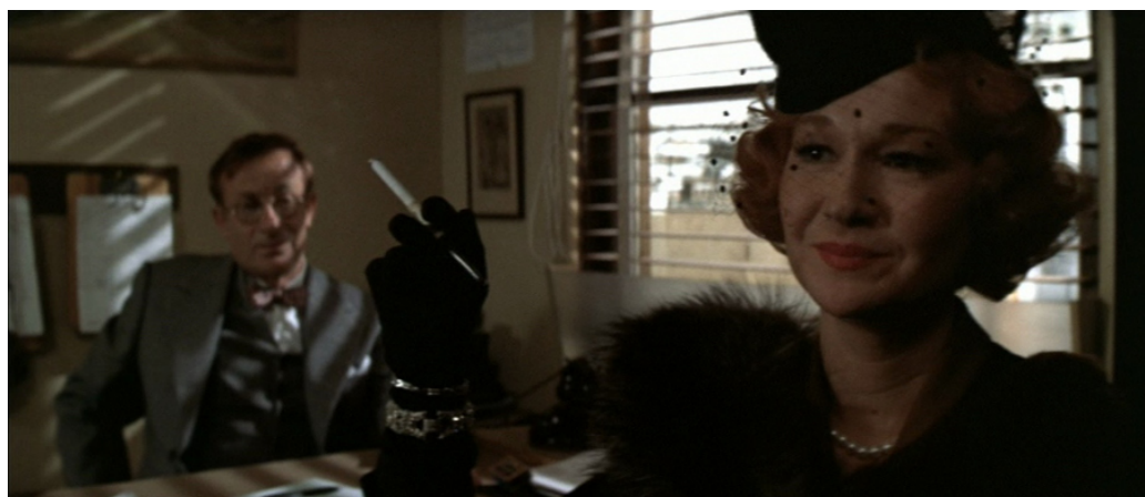
Fig. 11: Ida Sessions in the foreground with Gittes' Associates in the background

Chinatown employs the use of realistic settings. Roman Polanski's use of realistic settings brings the viewer back to 1930s Los Angeles. The discussion at the waterside in itself also lends credence to the central imagery of water and the ensuing scandal in the storyline. Noah Cross' exotic mansion also contributes immensely to boosting his status as a capitalist and one belonging to the top echelon within the society. This also gives