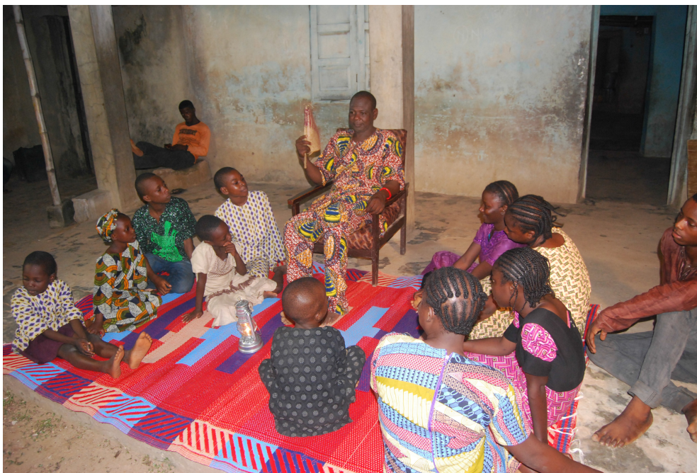
Fig. 21: The storyteller and the spectators during the storytelling session

It is important to say that the storytelling session in my documentary (fig.21) was created and set up by me, in order to be able to observe the mechanics of oral storytelling in the traditional Nigerian setting. Although I created the session, I ensured it followed the pattern and style of delivery in the traditional setting. It was important for me to use this method in order to bring the storytelling session under a controlled environment, for the purpose of my research. This is similar to the way scientists bring their experiments into the laboratory, in order to observe them more closely in a controlled environment.