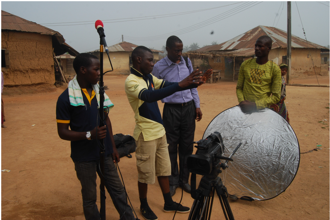
Fig. 29: The Camera person and myself discussing the coverage of a scene