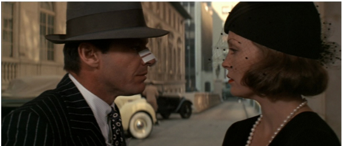
Fig. 12: Jake tells Evelyn that he feels she's hiding something

Through dialogue, Towne strengthens and helps the audience to know his characters and their uniqueness in great detail. From Gittes' dialogue that "I am not supposed to be one who is caught with his pants down", it can be deduced that Gittes is a professional who does not give up easily. Towne also creates suspense through dialogue in the screenplay. In the scene between Gittes and Evelyn after the interrogation by the police, Gittes reiterates "...and I still think that you are hiding something". This relates to Gittes' earlier dialogue to Evelyn "something else beside the death of your husband upset you". This dialogue helps evoke the curiosity of the audience.