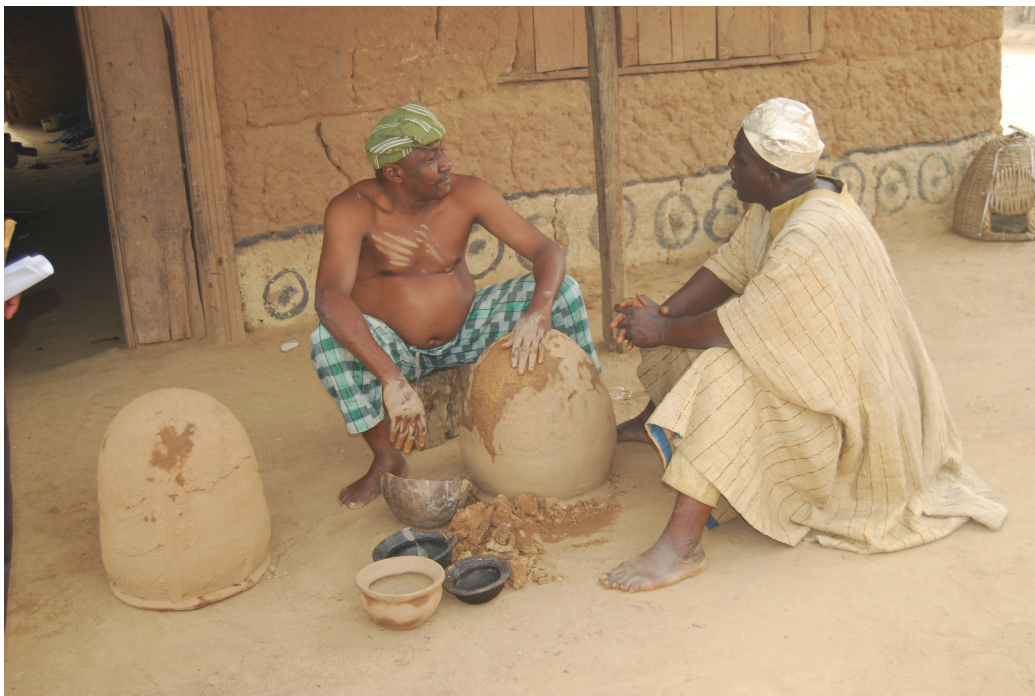
Fig. 28: The Pot maker and The Bead maker