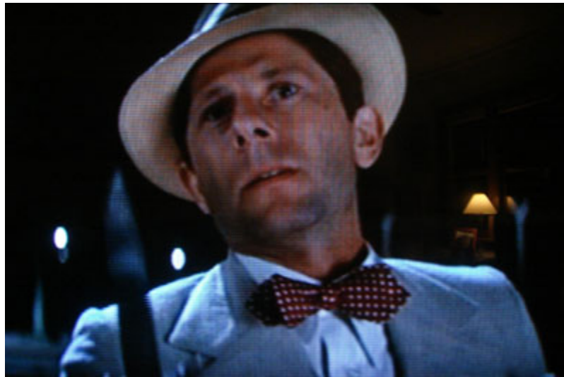
Fig. 6: Roman Polanski

and the director tore apart Towne's original script and reshaped it into the final draft that Polanski shot, but not without resulting in years of acrimony."