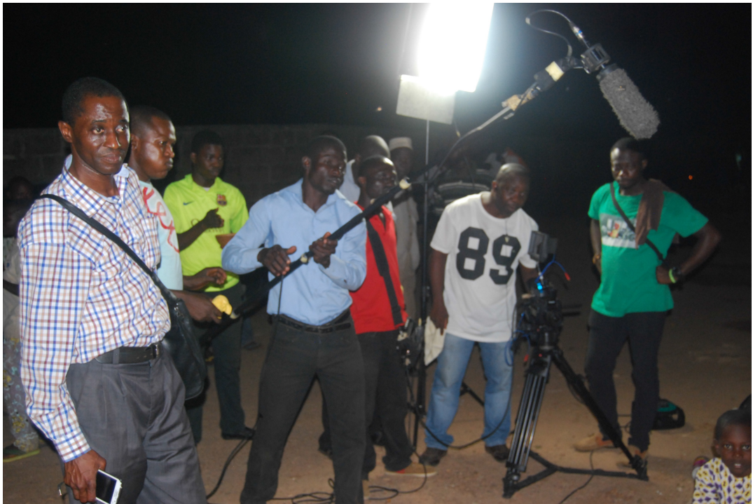
Fig. 22: The production crew and myself during shooting