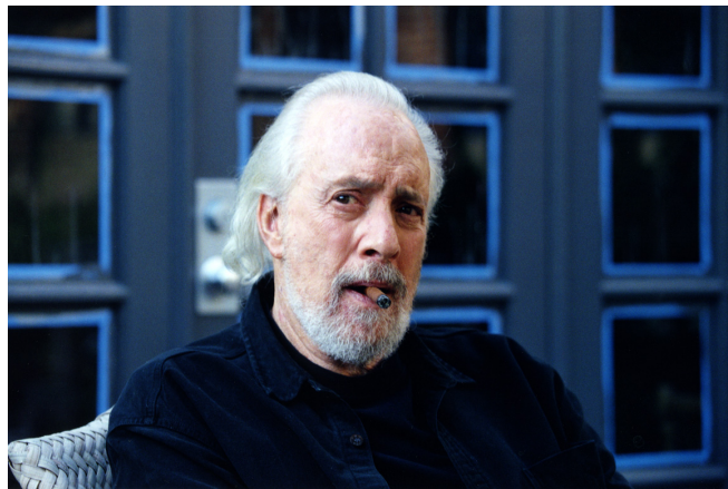
Fig. 4: Robert Towne

Caputo (2012: 181) also submits that Robert Towne was also inspired by the detective stories of Raymond Chandler, and that Towne wanted to recreate the L.A (Los Angeles) of the ‘30s’