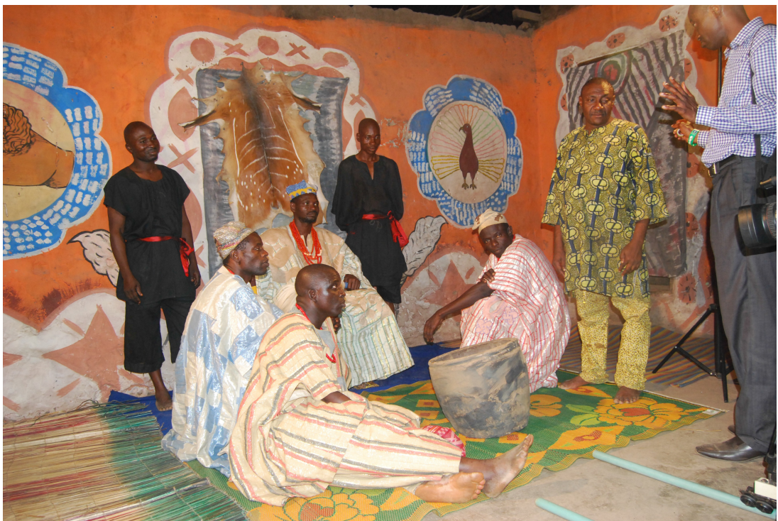
Fig. 30: Myself blocking a scene in the King's palace