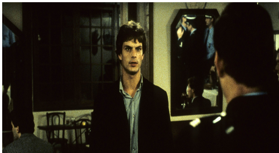
Fig. 17: Yvon during the killing of the family

After Yvon is released from prison, he goes to a hotel where he kills the hoteliers. The act of the killing is done off screen. He later finds his way to a woman's house. The woman accepts him. Yvon later kills the woman's entire family. In the final scene, Yvon hands himself over to the police and confesses that he is responsible for the killing of the hoteliers and the woman's entire family.