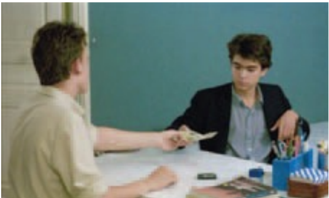
Fig. 18: Bresson uses drab green to create parallels among its various settings.

In L'argent , Robert Bresson creates parallels among its various settings by the recurrence of drab green backgrounds and cold blue props and costumes (Bordwell & Thompson, 2010:123). This minimal approach to the use of colours contrasts with the way colours are used in Chinatown and Thunderbolt . Even though, Chinatown portrays the dark sensibilities, characteristic of the noir and neo noir films, it still made use of realistic settings and costumes. An instance is during the meeting between Gittes and Cross; a band wearing different costumes is seen passing.