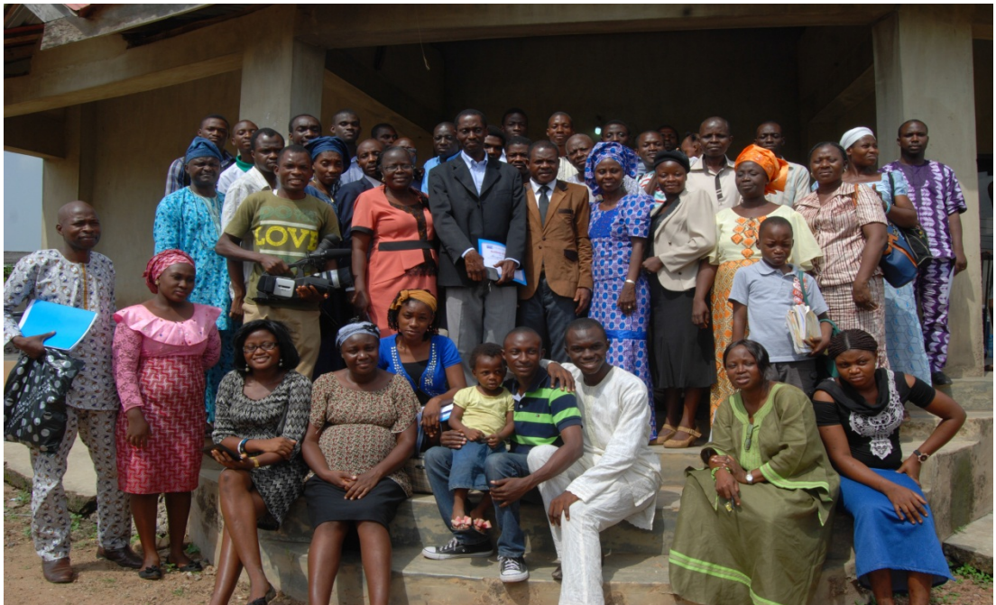
Fig. 40: The participants and myself at the basic screenwriting workshop