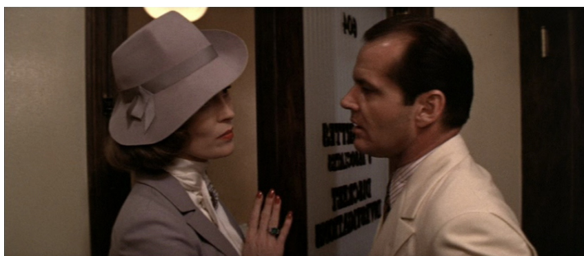
Fig. 8: Shot of Gittes and Evelyn suggesting imminent clash

In the scene where Evelyn meets Gittes in company of her lawyer, the shot composition when Evelyn is at the door and about to take her exit suggests confrontation and collision as they are shot in a profile, facing each other. This however contrasts with the composition of the shot in the scene where Gittes and Evelyn make love. In that scene, with the aid of editing, Gittes' close up and that of Evelyn are alternated, revealing the emotions and feelings on their faces. In that shot as well, the distance between them is not much, to suggest intimacy, finally resulting in kissing and lovemaking.