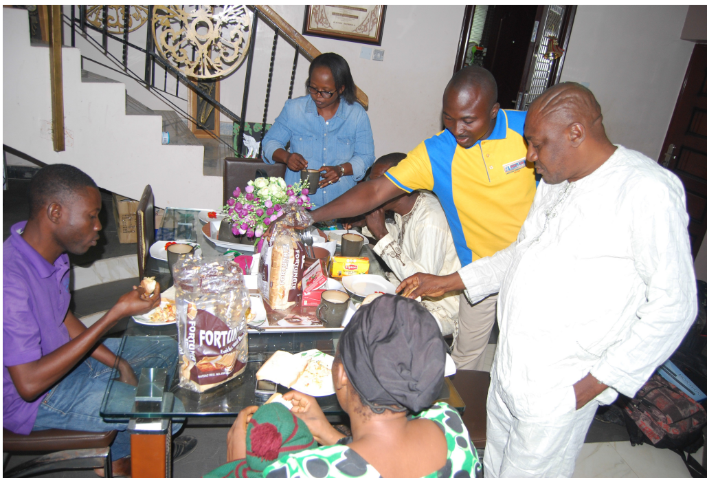
Fig. 31: Actors having breakfast before the day's shoot

Some of the scenes in my experiment are structured like stage performances, not using the cinema's full potential of showing moments of decision, arrival and leaving places. This challenge affects the flow of the story, because, there is the tendency for the audience to get confused because of the missing links. For instance, when Segun asks Bolu to pay back the money he lent him and leave his (Segun's) house, in the next scene, we see Bolu leaving the house. The audience is left to wonder if he actually paid back the money or not.