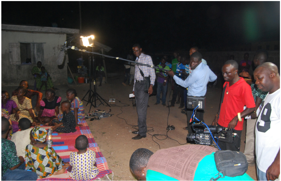
Fig. 24: The crew and audience during the shooting