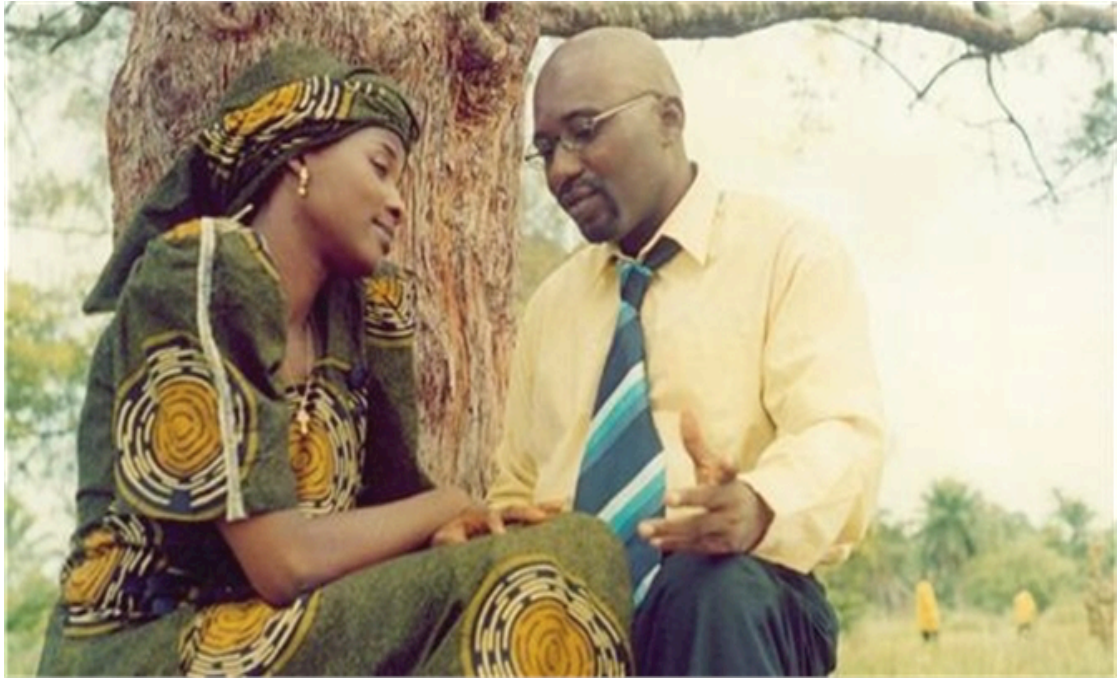
Fig. 3: Dimeji and Ngozi starting a new relationship

In Thunderbolt , some of the elements mentioned above are engaged in telling the story. This is why Diawara (1988:12) believes the African filmmaker has replaced the griot by saying “in oral tradition, it is through the griot’s point of view that one sees and realizes the universe around one. In film, the camera replaces the griot as the director’s eyes and constructs the new images of Africa for the spectator. It is in this sense that one says that the African film-maker has replaced the griot in the rewriting of history.”