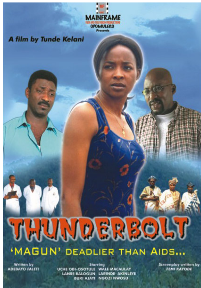
Fig. 2: Thunderbolt poster