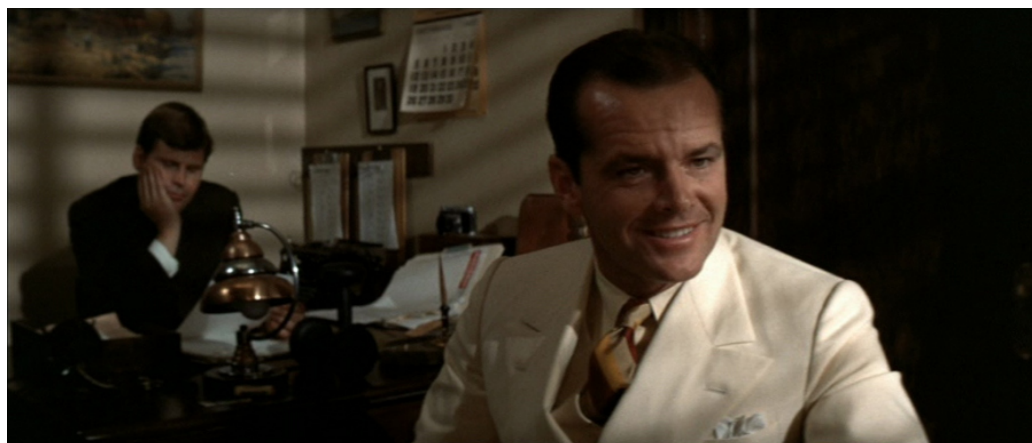
Fig. 10: Gittes in the foreground with Associate in the background

Every aspect of Chinatown comes with loads of information. For instance, in the scene between Gittes and Ida Sessions who disguised herself as Mrs. Evelyn Mulwray, Gittes and Ida Sessions are placed in the foreground in the shots, while Gittes' associates are in the background. Even in the main objects' close ups, we could see the associates reacting to the conversation.