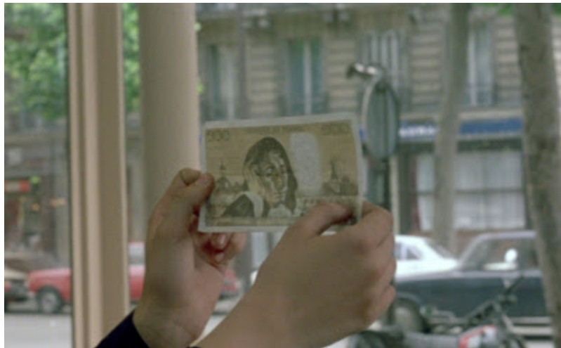
Fig. 14: The forged note