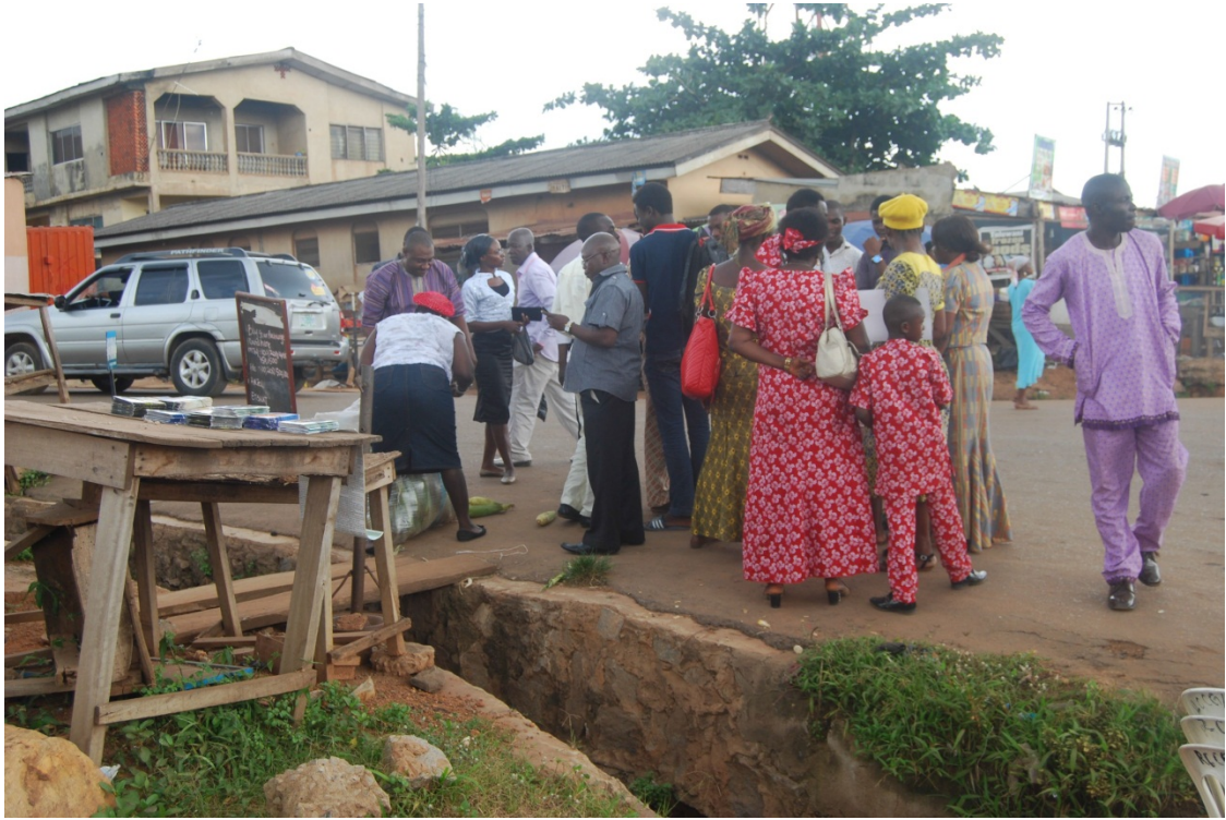
Fig. 41: A Practical session during the cinematic storytelling workshop