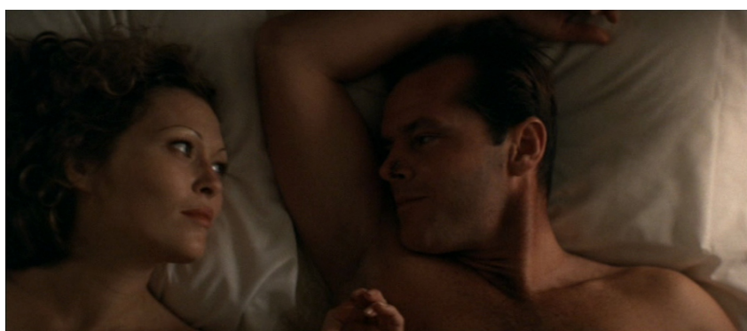
Fig. 9: Contrasting shot of Gittes and Evelyn as lovers.

The aesthetics of shot composition in Chinatown is worth mentioning. In the scene where Gittes confronts Evelyn Mulwray, and demands to know the truth, the camera is framed in a wide shot, with Evelyn standing and backing the camera, Gittes, sitting adjacent to her. The left side of the screen space remains bare until Gittes brings out the bifocals and places it on the centre stool, thereby giving the bifocals more prominence