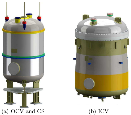
Figure 1: CAD models of the cryostat vessels and support. The OCV connects to three support legs mounted on baseplates and the ICV will be placed inside the OCV in vacuum. The full cryostat assembly stands 4.1 m tall.

(OCV) and the cryostat support (CS). Both the OCV and ICV contain a series of ports for cabling, liquid exchange and calibration sources. A CAD model of the cryostat is shown in Figure 1.