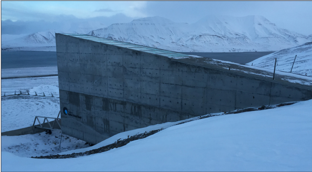
Figure 2: The Svalbard Global Seed Vault (SGSV), located on the island of Spitsbergen in Arctic Norway, is one of the Heritage Futures programme partners. Co-operated by Nordgen (the Nordic Genetic Resource Center) and the Global Crop Diversity Trust, it aims to provide a secure repository for the maintenance of global crop diversity.

and experimental exhibition work (after Macdonald and Basu 2007). The outcomes of the project will be shared with practitioners, policy makers and academics through a range of outputs, including training and capacity building resources, policy briefings, short films, books and journal articles.