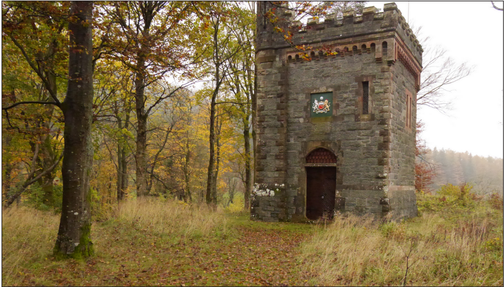
Figure 1: The pump house of Thirlmere reservoir in the Lake District hides its intervention in the landscape behind heritage tropes. Concepts of ‘forever’ overlap with ‘timeless nature’.