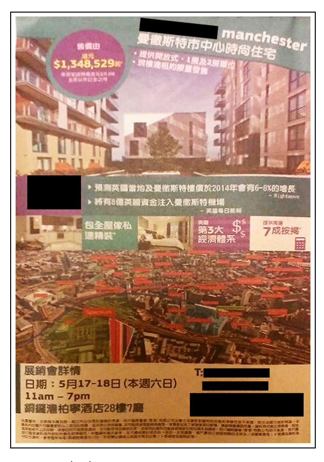
Figure 2. Manchester property development.

the market has opened as developers sell newbuilds in second-tier cities. According to informants, investors are currently able to buy properties in Liverpool, Sheffield, Newcastle and Manchester for between £60,000 and £150,000, and buyers here are more likely looking for buy-to-let investments. Other types of properties such as student accommodation can be purchased from as low as £30,000, with a rental yield of 10% annually. However, investors are reminded that the potential for selling the property is slim because of widespread availability.