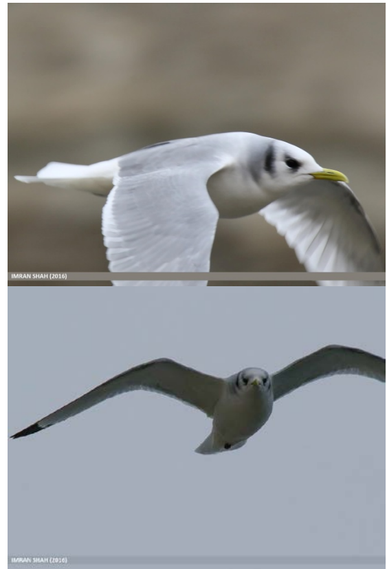
Figure 1: Black-legged Kittiwake photographed at Borith Lake, Pakistan in December 2016.

Vagrancy distances for BLK have been stated to be a few hundred km (Rusk et al. , 2013), however different reports indicated land penetration of this species in North America up to 1,600-2,600 km (Connelly and Gates, 1981; Weber and Lavirison, 1977; Haywood, 1976; Verner, 1974; McCreary, 1937). Connelly (1981) suggested the extension in the bird's home