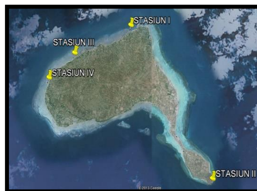
Fig. 1 Map of Gili Genting Island (Photo of map is taken from https://www.google.co.id/maps/ ).

Gili genting Island located at southeast side of Sumenep District. In this study, we conducted field observation in four station as follow: (1) Station I belongs to Bringsang village where small ship harbor located (coordinate: 07°10.565'S - 113°55.134'E); (2) Station II belongs to Gedugan village and almost no people activities in this area (coordinate: 07°13.817'S - 113°57.283'E); (3) Station III belongs to Aenganyar village where the population of people is concentrated. (Coordinate: 07°11.195'S - 113°53.619'E).; (4) Station IV is located in Aenganyar village that is naturally undisturbed by human activities (coordinate: 07°11.751'S - 113°52.944'E). Detail of each station was shown in the map (Fig. 1).