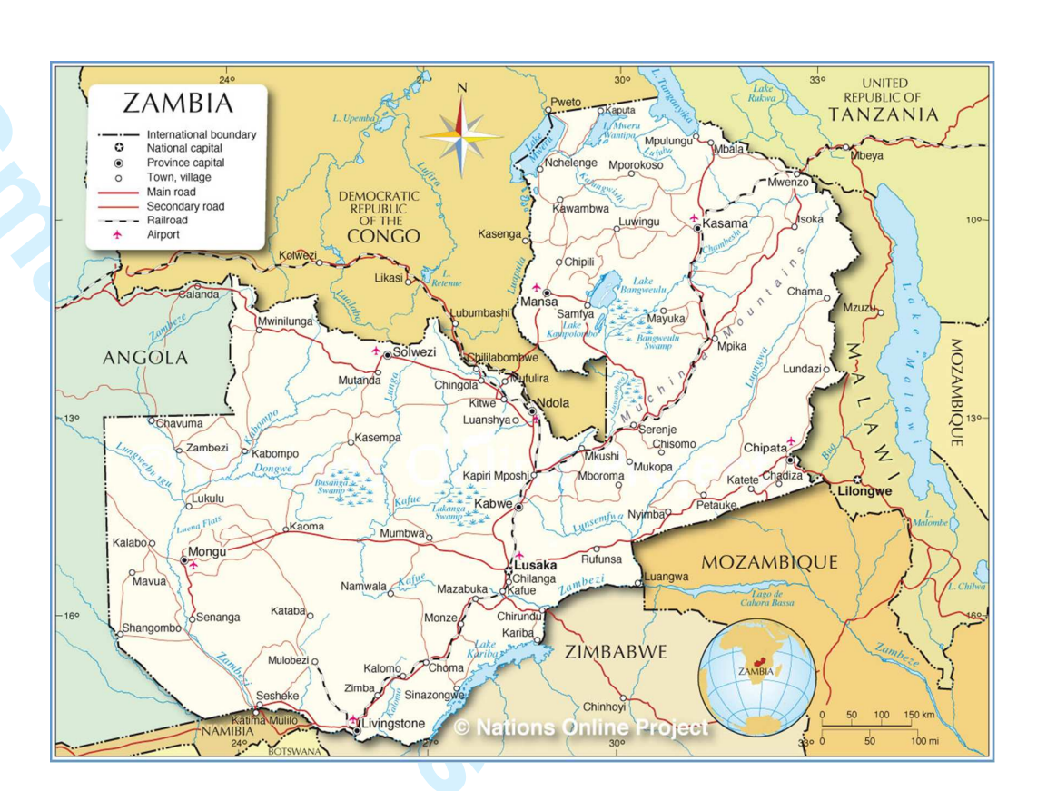
Figure 1: Zambia – Urban centres and communications