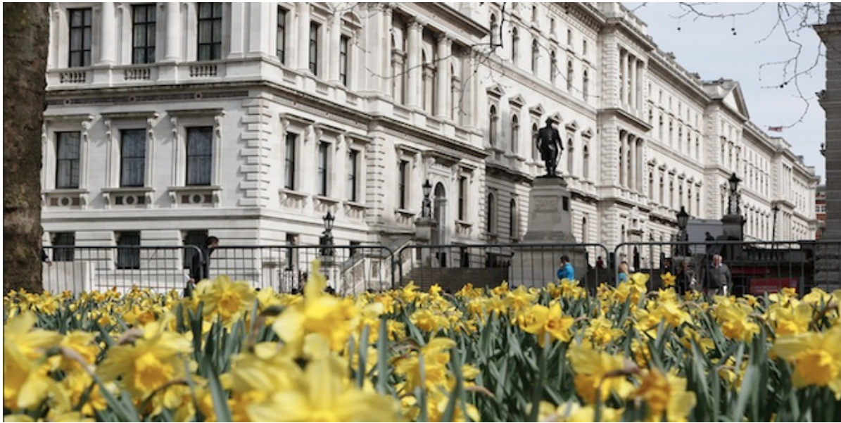
UK Foreign and Commonwealth Office building.

interesting, they feel disjointed and could have benefitted from more of a common structure. At times, it feels like the discussion of capacity was an appended afterthought to other points the authors wanted to prioritise, and in a way this collection is a missed opportunity to begin the carving of a frame for future empirical studies of capacity that one day might allow for more systematic analysis. However this criticism could also be called out as unfair – constructing an approach that is at least somewhat common to problems that have very different features is hardly a straightforward task, and learning what springs to mind when different fields are asked about ‘capacity’ is of interest in itself.