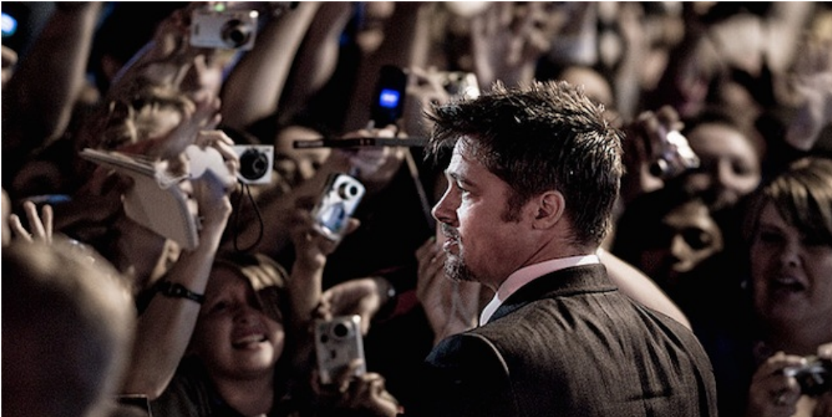
Brad Pitt at the premiere of Burn After Reading.