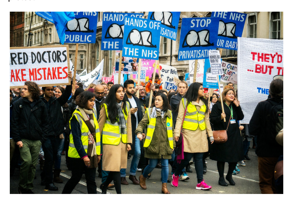
Junior doctor protest in London

The effect of interaction in networks on the propensity to participate in politics is contingent on the amount of political discussion that occurs in social networks and the information that people are able to gather about politics as a result. Individuals who feel efficacious are more likely to participate in protest provided that they are embedded in social networks which offer an opportunity to discuss and learn about politics. In other words, this is where people talk politics and thus where perspectives on the socio-political world are constructed and people are mobilized for protest.