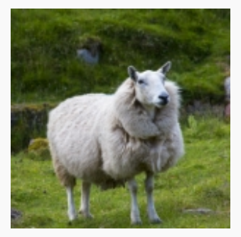
The loss of EU agricultural subsidies would put the onus on Defra to help farmers.

Despite the warnings associated with the budgetary costs of the Norway model, a no to Europe would almost