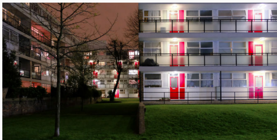
Social housing at Churchill Gardens, central London.

Similarities across the countries are evident in the field of social housing. The most important common finding is that the take-up of social housing is lower among EU10 citizens than natives, mainly due to long waiting lists, a fact which reflects that access to social housing is problematic also to other citizen groups, including host country nationals. In the Netherlands, for example, a recent survey carried out in Amsterdam covering 500 resident EU mobile citizens found that: